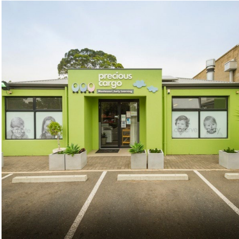
WESTBOURNE PARK Number of Approved Places 105