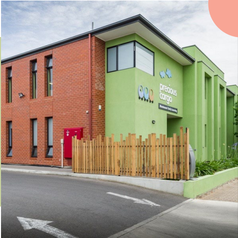
COLLINSWOOD Number of Approved Places 169