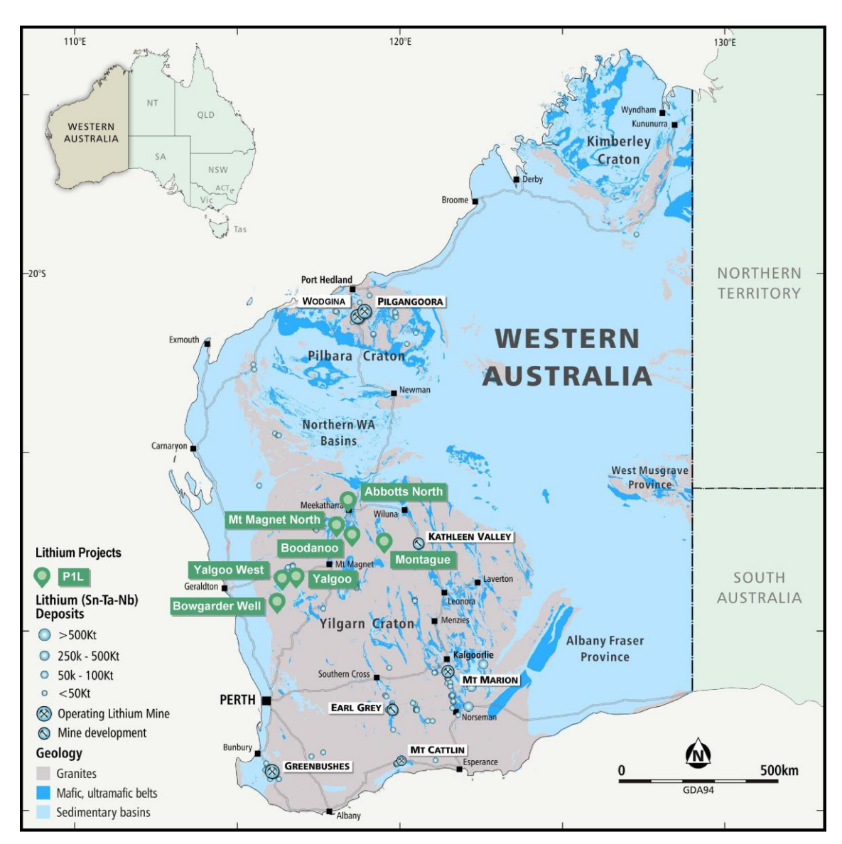
Figure 1: Location of main projects within Premier1 portfolio.

and follow up exploration was not completed by the Company due to competing priorities at the time and the changing emphasis towards lithium exploration.