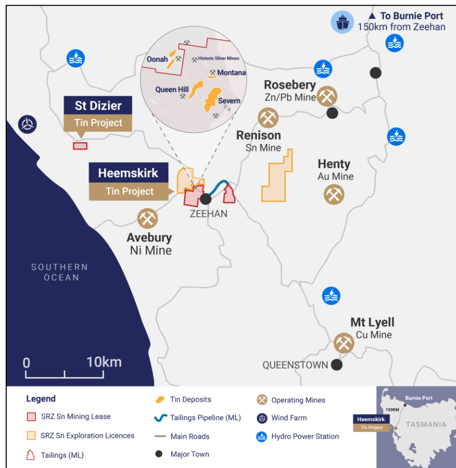
Figure 3 – Stellar Resources Heemskirk Tin Project Location

Stellar also made a major discovery at its North Scamander Project in September 2023, with a maiden exploration drillhole intersecting a significant new high-grade silver, tin, zinc, lead and Indium polymetallic discovery. The Company has also delineated multiple down hole conductions via DHEM and FLEM surveys, providing high priority follow up targets.