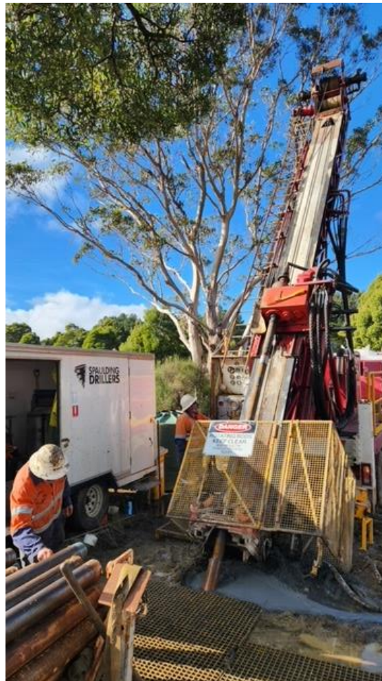
Figure 2 – First Diamond Drill Rig at the Heemskirk Tin Project