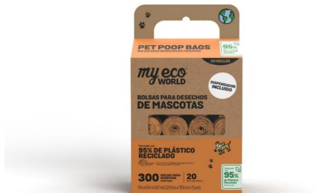
SECOS MyEcoWorld 95% Recycled Plastic Dog Bags supplied to Costco Mexico via JCC

In Q4 FY24 JCC was awarded the supply of post-consumer recycled dog bags to Costco Mexico representing the company's first orders of this new product range, which is made by SECOS using Certified 95% recycled soft plastic. This product addresses the critical need for effective recycling solutions in a world where only 9% of plastics, including soft plastics, are recycled globally. Post-consumer recycled plastic is sourced from items that have been used, discarded, and collected through recycling programs. All MyEcoWorld recycled products are certified under the Global Recycled Standard (GRS), guaranteeing the recycled material has been independently verified at each stage of the supply chain, from the source to the final product. This rigorous certification process sets us apart in a market that is increasingly vulnerable to greenwashing practices.