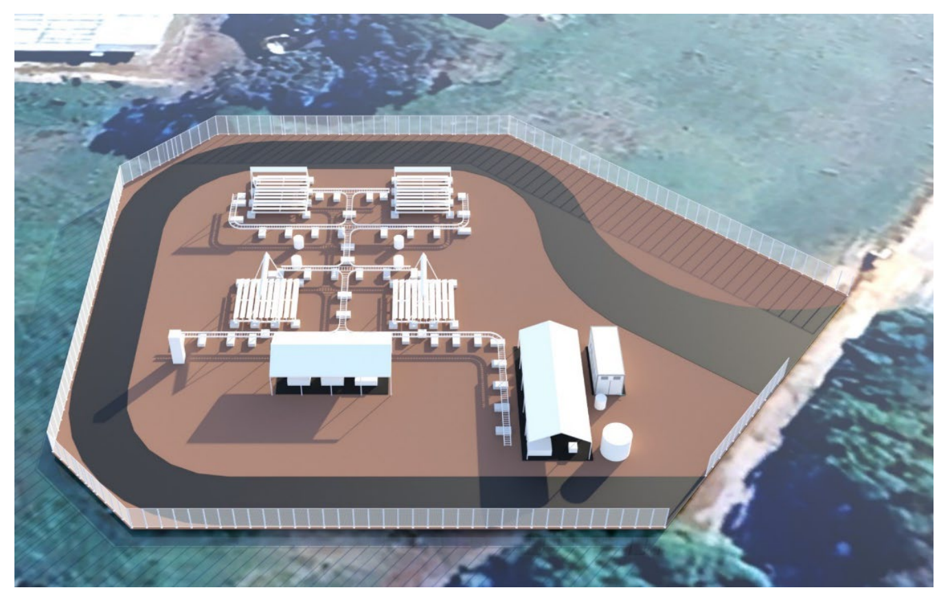
Figure 1: 3D pilot plant model based on Incitias' pre-FEED study

Sparc Hydrogen has engaged Incitias Pty Ltd ( Incitias ) to complete front-end engineering and design for a pilot plant planned to be located at the University of Adelaide's Roseworthy Campus. Incitias is a leading global engineering and commercial service provider headquartered in Melbourne which is dedicated to facilitating energy transition projects worldwide. Incitias also led the pre-FEED study completed in Q4 2023 on behalf of Sparc Hydrogen. The FEED study will build on the flowsheet developed during the pre-FEED which included four linear Fresnel modules within an end-to-end green hydrogen production system (Figure 1). The plant will allow Sparc Hydrogen to independently and concurrently test different reactor designs and photocatalyst materials. Sparc Hydrogen is not aware of any similar facilities developed for testing photocatalytic water splitting under concentrated solar conditions worldwide.