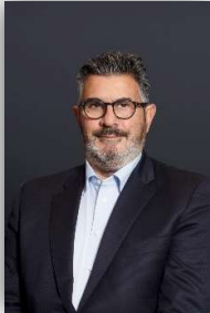
Mr Andrew Demetriou

The Directors of Capitol Health at any time during or since the end of the financial year are: