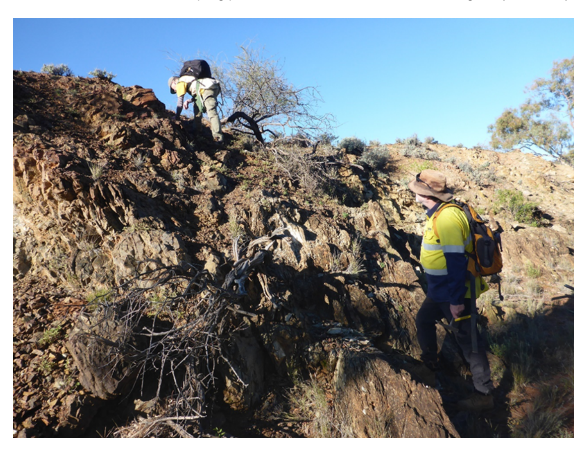
Figure 2: SER's exploration team led by Dr Chris Yeats and Dr Steve Beresford undertaking reconnaissance field mapping program at the West Koonenberry Project in July 2024.

The mapping confirmed that units with a high magnetic response in the southern part of EL9621 outcrop as thin, strongly boudinaged plagioclase-phyric basaltic lavas within a sequence of chloritic schists. Further north, magnetic highs correlate with similar chloritic schist units, hosted within a sequence of carbonate-rich foliated metasiltstones. A structurally complex, strongly magnetic zone approximately 7km in diameter in the central portion of the Project is also interpreted to include mafic igneous units. It lies entirely beneath shallow recent cover and will be the focus of soil sampling planned under the CSIRO Kick-Start Program (see below).