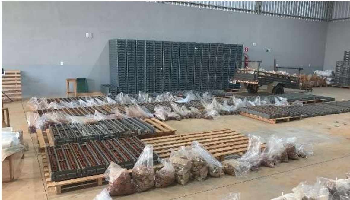
Figure 5: RC and Diamond drill sample batches are stored in the core shade