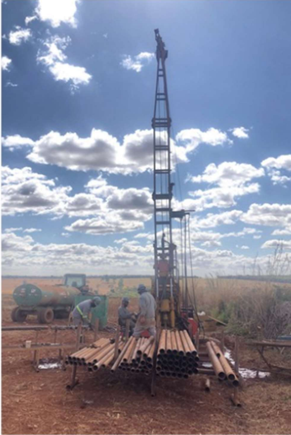
Figure 1: Diamond drill rig at DD 008 drill pad during operation in Coda North