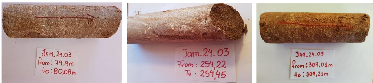
Figure 1. Three of the five cores sent to Core Laboratories for testing

Patagonia Lithium Ltd (ASX:PL3, Patagonia or Company) is very pleased to announce that five cores have been selected for core analysis to give the geologists effective and total porosity values to input when they compute the Mineral Resource Estimate.