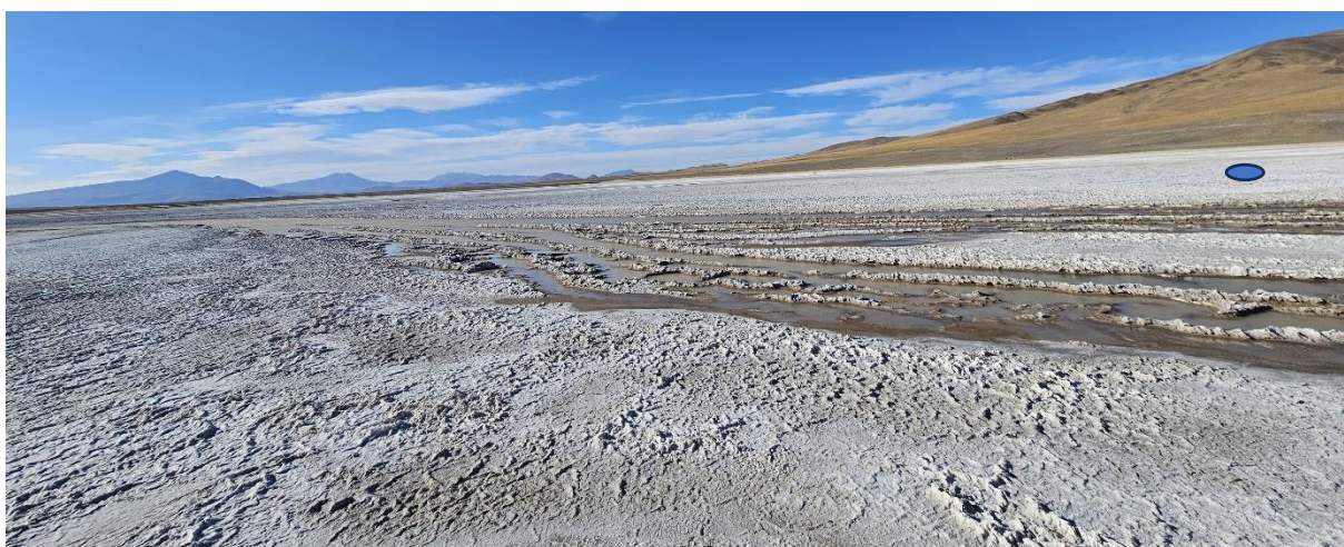
Figure 2. Location of well 4 blue dot (top right) showing salt on surface

Phillip Thomas, Executive Chairman commented "These cores contain sand and quartz gravel and reflect the high porosity geology in the Paso basin. One of the critical factors in lithium production is to have high porosity and ideally sands with high pore values and high connectivity. Examination of the sections in the field demonstrates these qualities. Clay content is very low and in some cores not present."