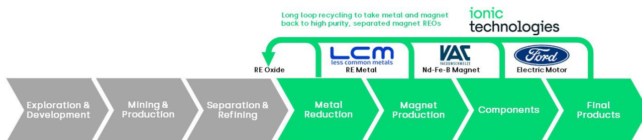
Figure 6: Ionic Technologies' long loop recycling feed opportunities back to magnet REOs, and key supply chain partnerships announced to date.

In September 2023, Ionic Technologies announced collaboration partnerships with Ford Technologies, Less Common Metals (LCM) and the British Geological Survey (BGS) to build a domestic UK supply chain, from recycled REOs to metals, alloys and magnets and supplying UK based electric vehicles (EV) manufacturing, with potential to replicate across other key markets. In October 2024, IonicRE announced further collaboration with supply chain partners Less Common Metals (LCM) and VAC, in aims to establish a sustainable, Western supply chain for rare earth magnets.