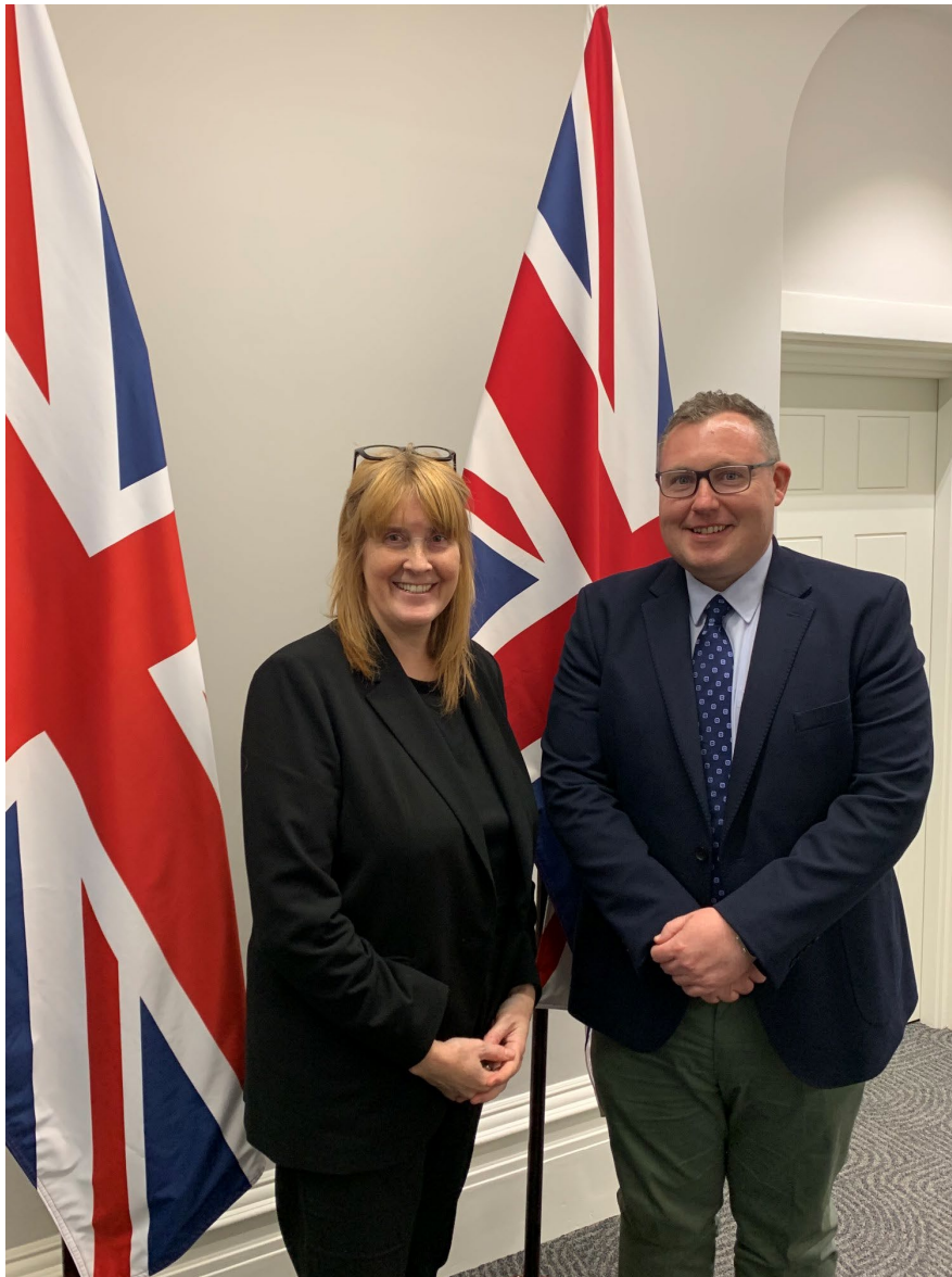
Figure 1: IonicRE Managing Director Tim Harrison (right) with Sarah Jones MP, Minister of State at both the Department for Energy Security and Net Zero, and the Department for Business and Trade, during a recent meeting in London, UK.

The UK Government's support underscores its commitment to advancing the country's leadership in magnet recycling and building a sustainable, ex-China supply chain for critical materials. This initiative supports Ionic Technologies' vision of commercialising magnet recycling and strengthening the UK's role in the circular economy for critical raw materials.