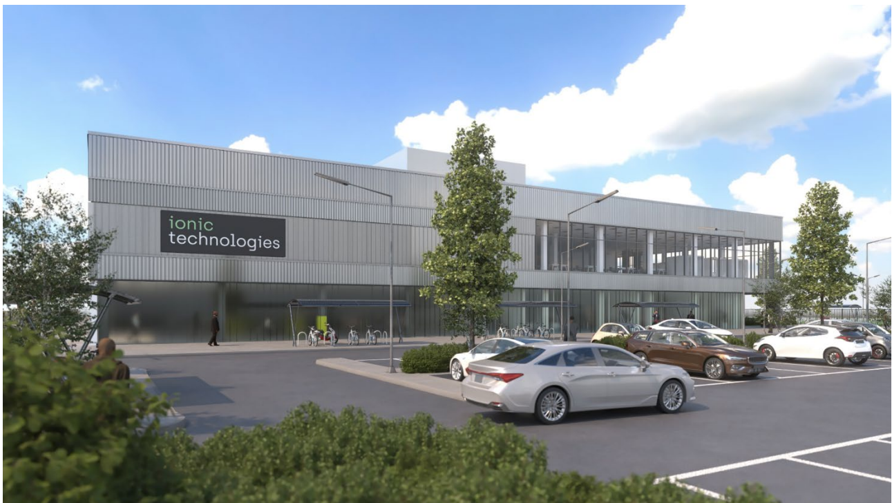
Figure 2: Render of the commercial plant design as part of the Feasibility Study and planning application underway in Belfast, UK.

The Feasibility Study has identified a potential processing cost range of around US$25-30 per kilogram REO for recycling and selling prices in the forecast range of US$80-$100/kg for NdPr oxide, US$500-$600/kg for Dy oxide and $1,200-$1,500/kg for Tb oxide by 2030 to be produced by Ionic Technologies.