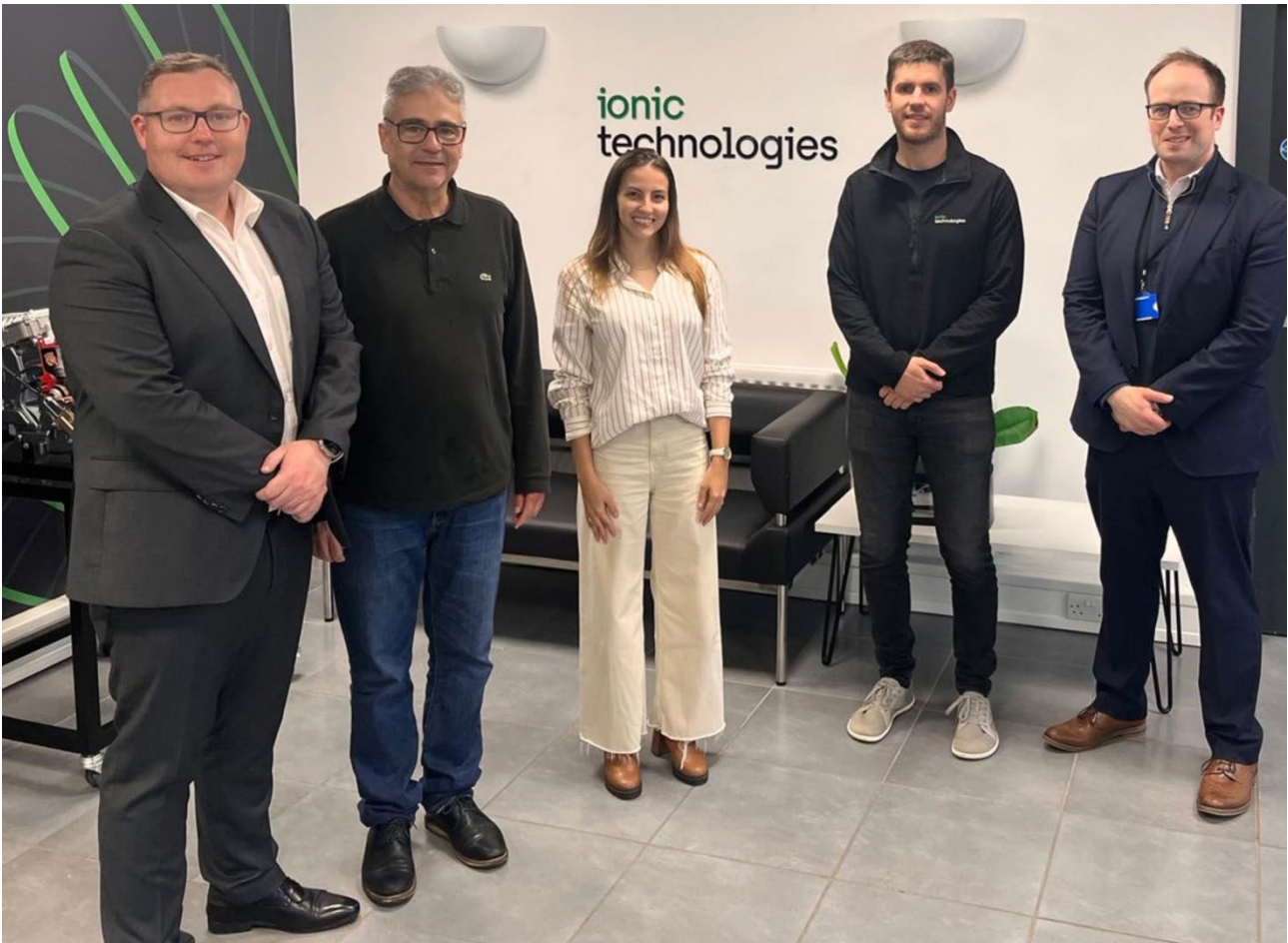
Figure 5: Representatives of Invest Minas recently visiting Ionic Technologies' Belfast Demonstration Plant.

the joint venture. Invest Minas is an international investment and trade promotion agency set up by the Minas Gerais State Government to attract and develop investments in the state.