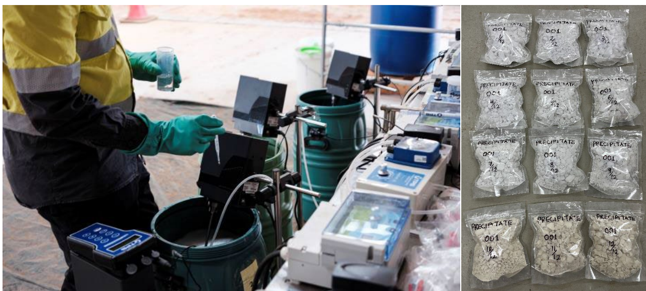
Figure 3: Demonstration plant precipitation circuit and inventory of MREC samples dispatched to Australia for analysis.

During the September quarter, the RRM team continued demonstration plant activities, with MREC production in Uganda being used to support ongoing offtake negotiations for Makuutu's magnet and heavy rare earth-rich basket. The first shipment of samples has since left Uganda and is currently being analysed in Australia before being dispatched to potential offtake partners.