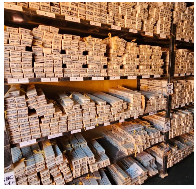
Figure 2: Geology stores and RC chip storage