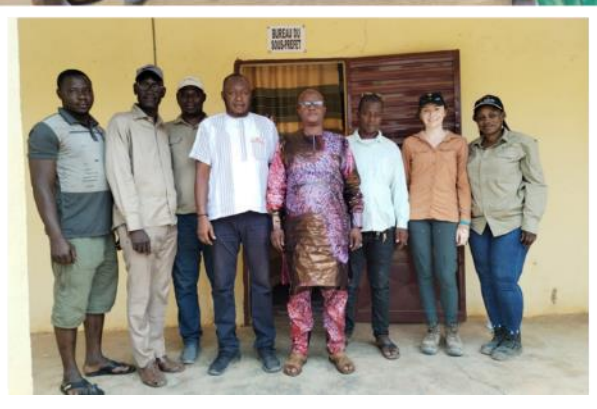
Figure 5: Weather station installed at Niandankoro Camp and meetings with local dignitaries and community leaders