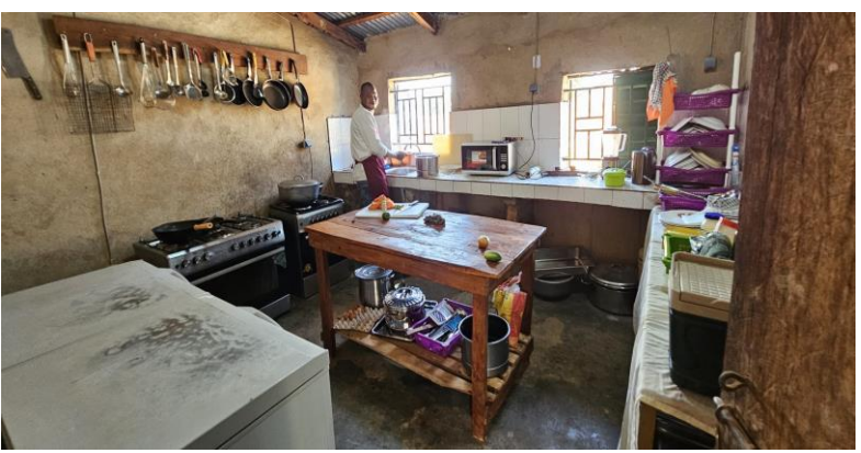
Figure 1: Niandankoro Camp