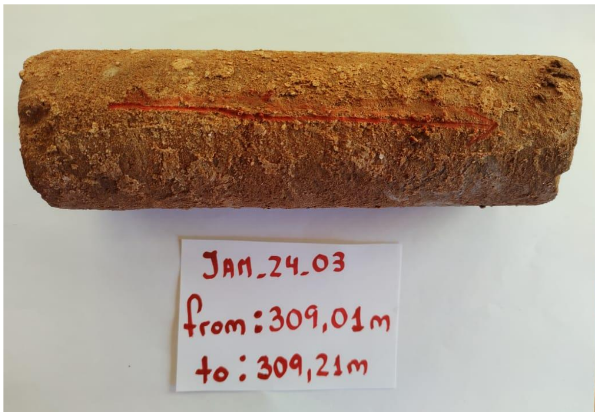
Figure 1. Core 10 showing sandy matrix with reddish brown clay transition.