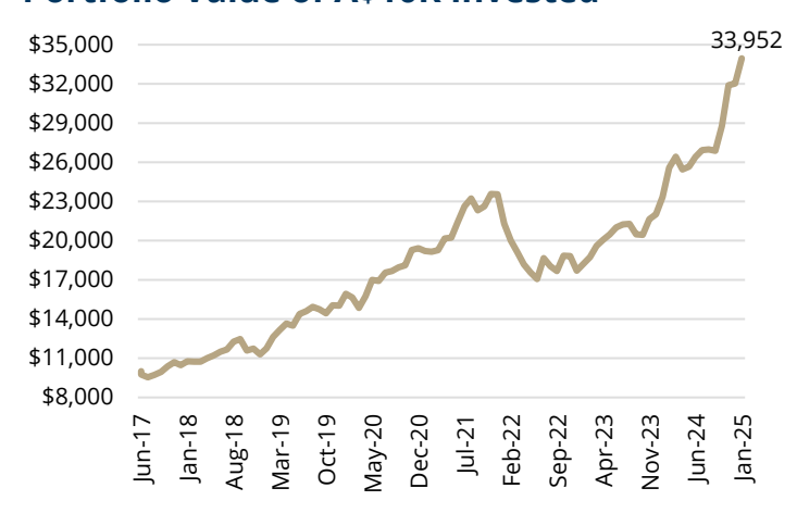
Notes: 1. Calculations are based on the portfolio return in AUD and calculated before expenses and after investment management and performance fees. Portfolio value includes the reinvestment of dividends and income. Source: AGP International Management Pty Ltd.