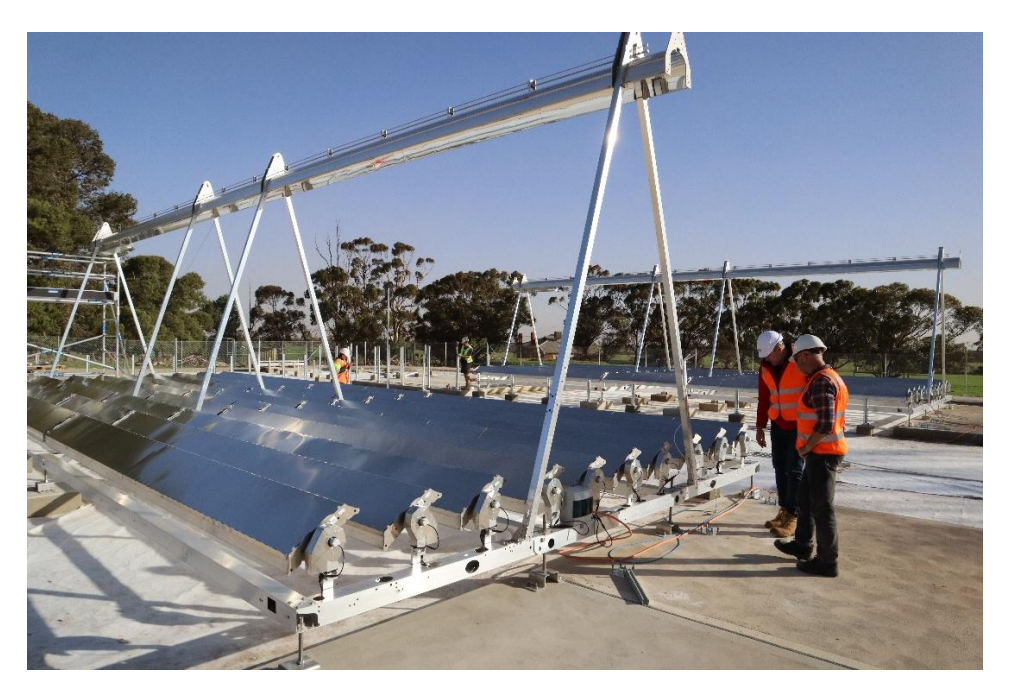
Figure 1: Sparc Hydrogen's Roseworthy pilot plant during June 2025

An opening ceremony is being held today, Tuesday 24<sup>th</sup> of June, at the University of Adelaide's Roseworthy Campus with key stakeholders in attendance including senior representatives from the Sparc Hydrogen joint venture partners, the South Australian Government and Shinshu University in Japan. The pilot plant represents a major step towards scaling and commercialising Sparc Hydrogen's patented PWS reactor technology delivering next generation green hydrogen production which is modular, scalable and, importantly, requires limited electricity. Sparc Hydrogen is a partnership between Sparc Technologies, Fortescue Ltd and the University of Adelaide which has been developing patented PWS reactor technology since 2022.