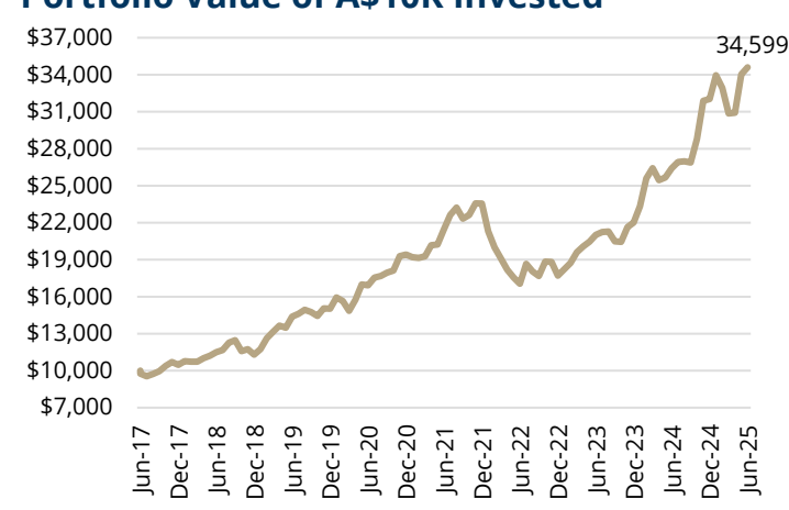
Notes: 1. Calculations are based on the portfolio return in AUD and calculated before expenses and after investment management and performance fees. Portfolio value includes the reinvestment of dividends and income. Source: AGP International Management Pty Ltd.