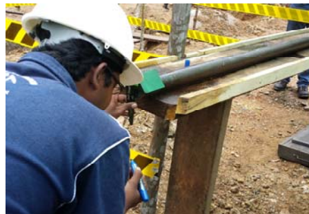
Core orientation prior to removing core

Training on the core orientation tools is complete and the tools are in operation. Down hole survey equipment will arrive in Sri Lanka on the 16 th of June and MRL crew training will be undertaken. The down hole survey equipment will be used to measure the down hole Azimuth and Dip of DH1 and subsequent holes.