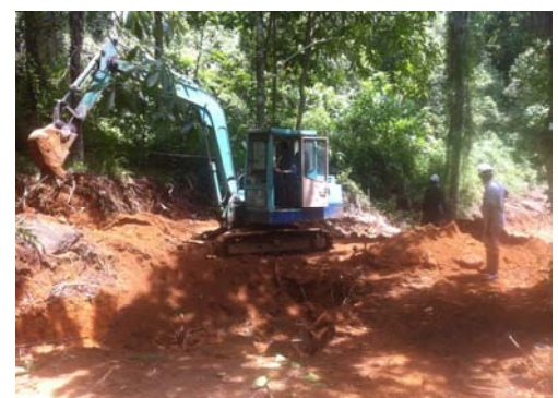
Preparation for concreting DH2 drill pad

Drill hole DH1 is located at Pandeniya and is expected to be between 50m to 125m in depth. Drill holes DH2 and DH3 will be up to 300m deep and are designed to test the continuity of vein graphite mineralisation below the historical shafts and adits (Figures 1 & 2).