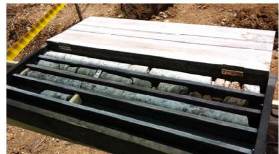
Core tray with DH1 core

Repairs have been completed to the drainage and access road which had incurred damage from heavy rain and the DH2 pad will be constructed in coming days.