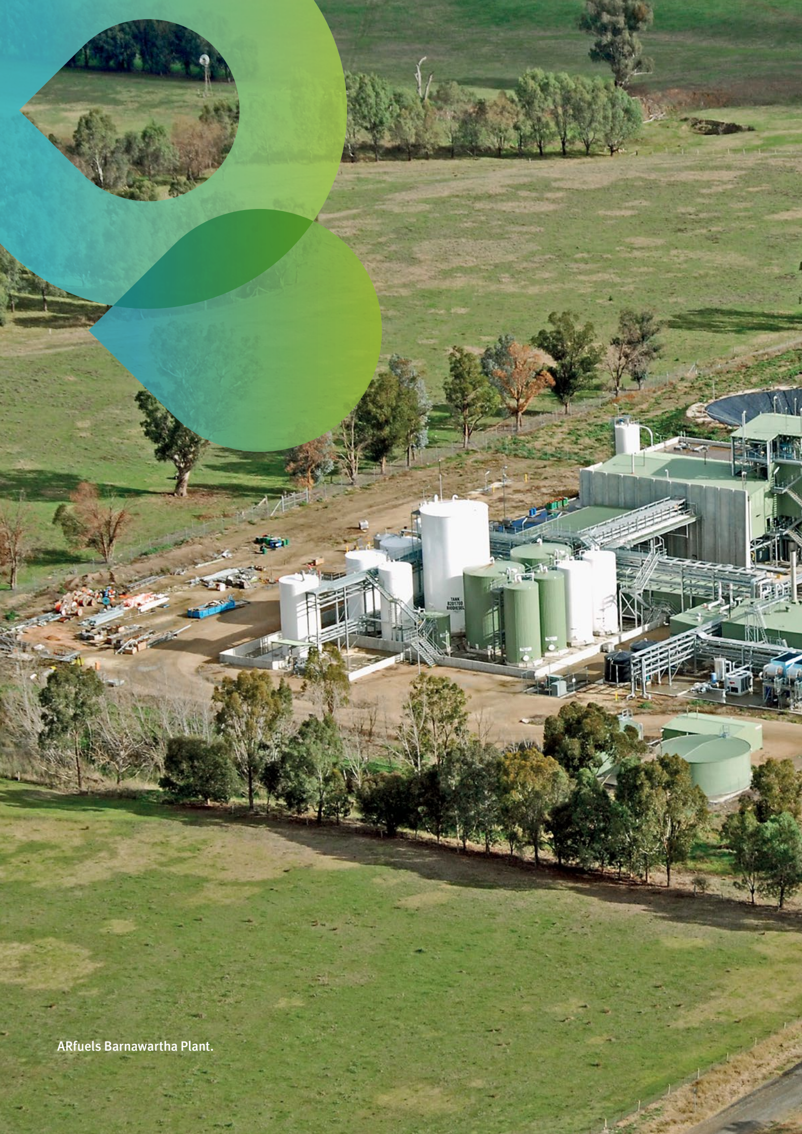
ARfuels Barnawartha Plant.