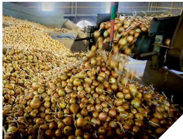
Field Fresh Tasmania's onion factory, Devonport, TAS.

Addressing risk and supporting production plans, the company's onion operation is well positioned with forward contracts for the 2015 crop in place.