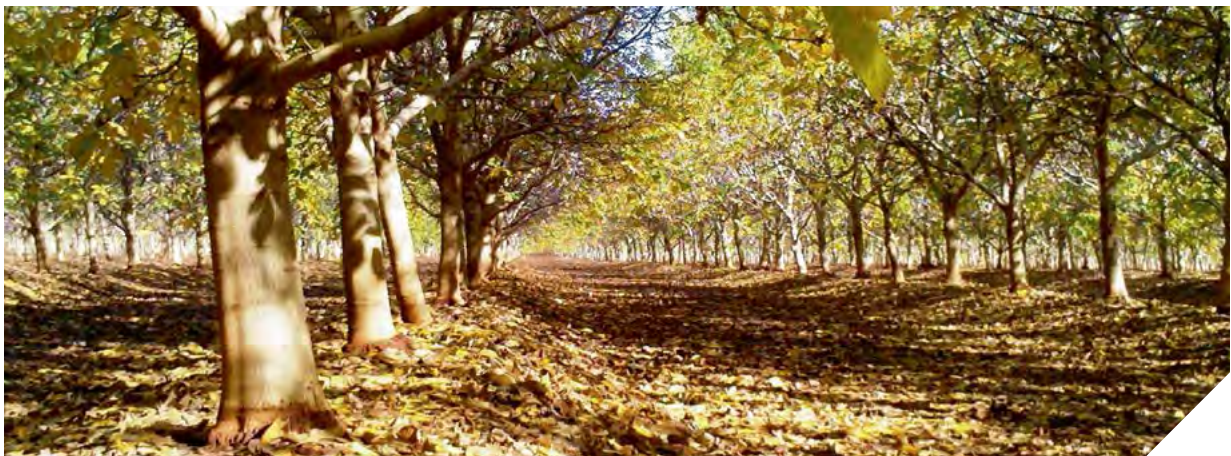
Riverina Orchard in Autumn

Director's shareholdings are disclosed on page 25 of the Remuneration Report. There has been no change in Director's shareholding between the end of the financial year and the date of this Director's Report.