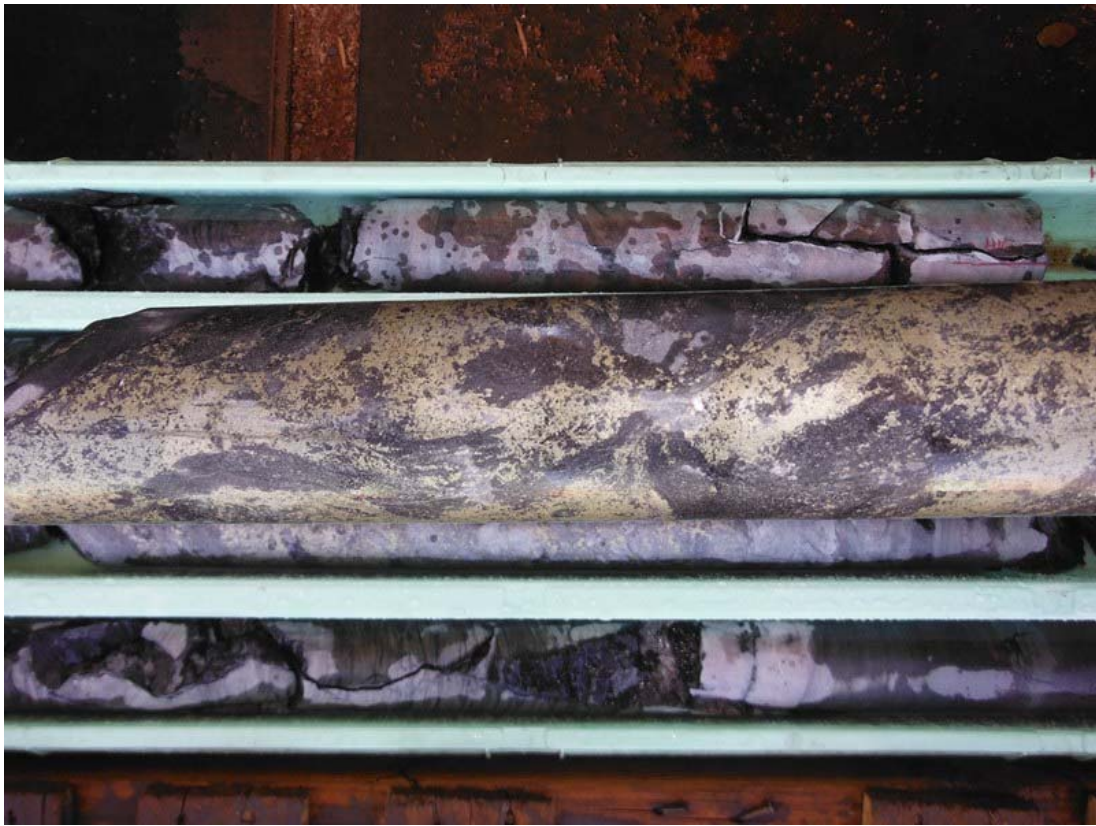
Figure 1 Hole KJD010W1 showing some of the mineralisation from 1,097m to 1,107m