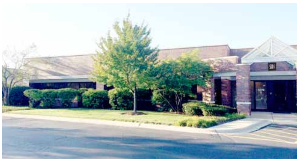
USA OFFICE – SDI INC. – CHICAGO