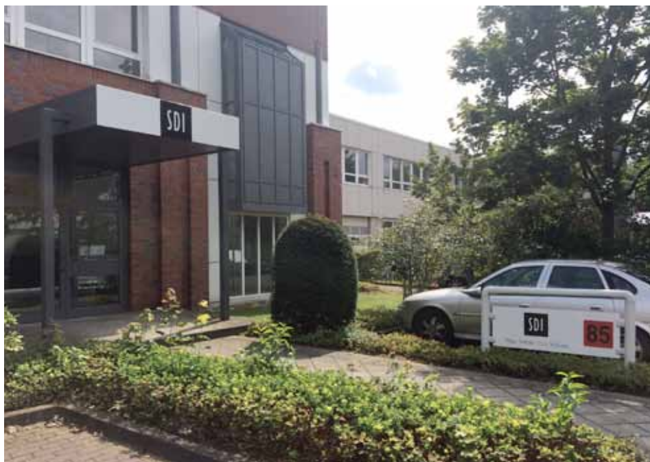
GERMANY OFFICE – SDI GMBH – COLOGNE

SDI is investing for the future. We have recently relocated both our German and United States offices to larger locations. Both the Cologne office/warehouse and the Chicago office have more than doubled the space we previously had.