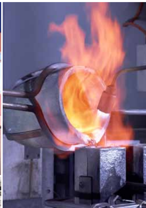
Leaders in precious metals metallurgy

Our R & D department focuses on development of new and innovative products, but they also continually improve existing products. To do this, they need incredibly advanced equipment. For example, our latest acquisition is an Environmental Scanning Electron Microscope, ESEM, which provides magnifications of over 100,000 times so we can further advance the particles that our restoratives, or fillings, are made up of.