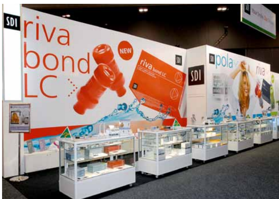
ADA Sydney, 2014

We understand that SDI were among the few Australian manufacturers to be awarded this for medical devices. Having GMP for Brazil will allow SDI to further increase its business in Brazil and be more competitive with local manufacturers.