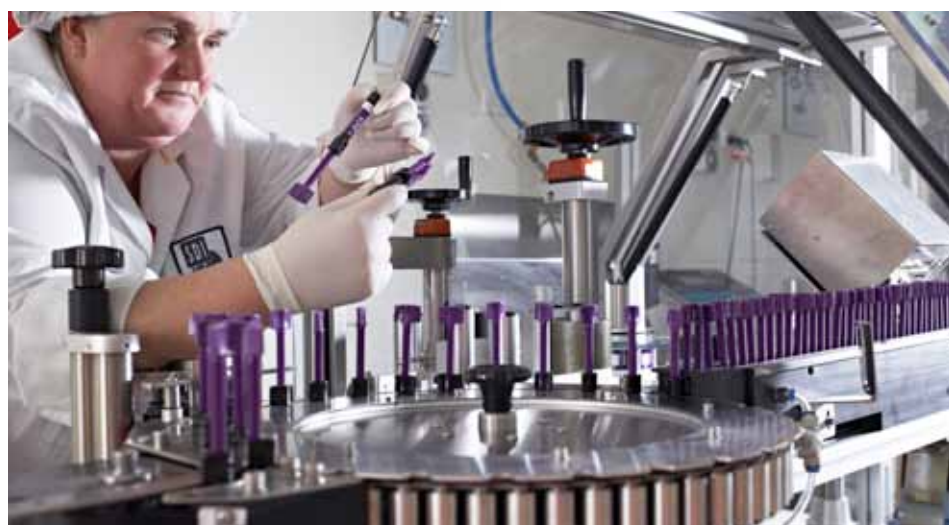
Investments in high speed filling and packaging