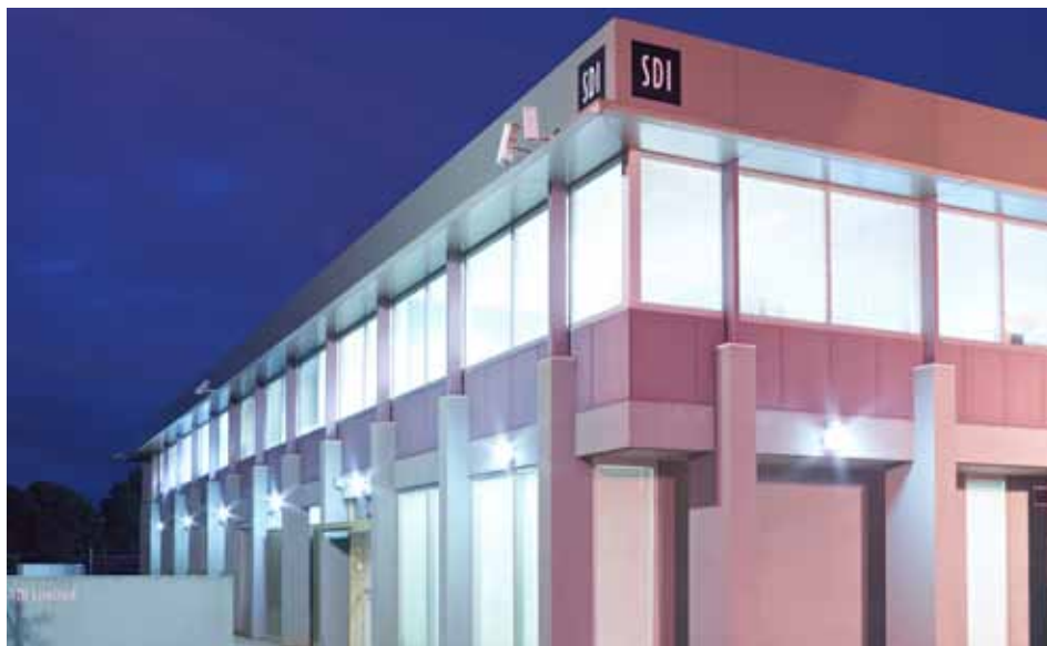
Bayswater Head-office incorporating administration and R & D

“Ongoing investment in R & D is paramount”