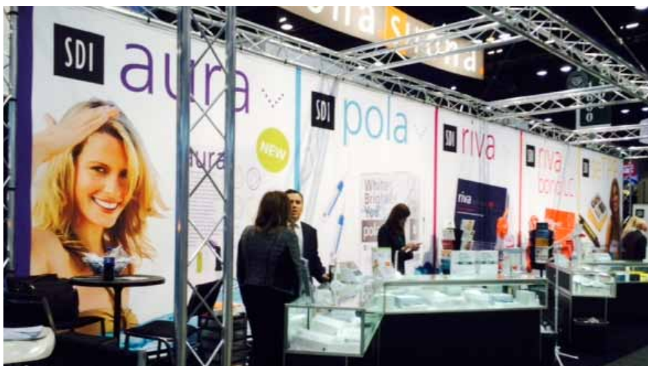
Chicago Midwinter Meeting, 2014

Whilst this is a small exhibition compared to the international ones SDI participates in, it was important for SDI. Australia is where we are closest to dentists; we get a very good feeling what they think of our products and gain critical marketing information which can be utilised in our overseas markets. We are their "Australian Made" company and we have a very close relationship with them.