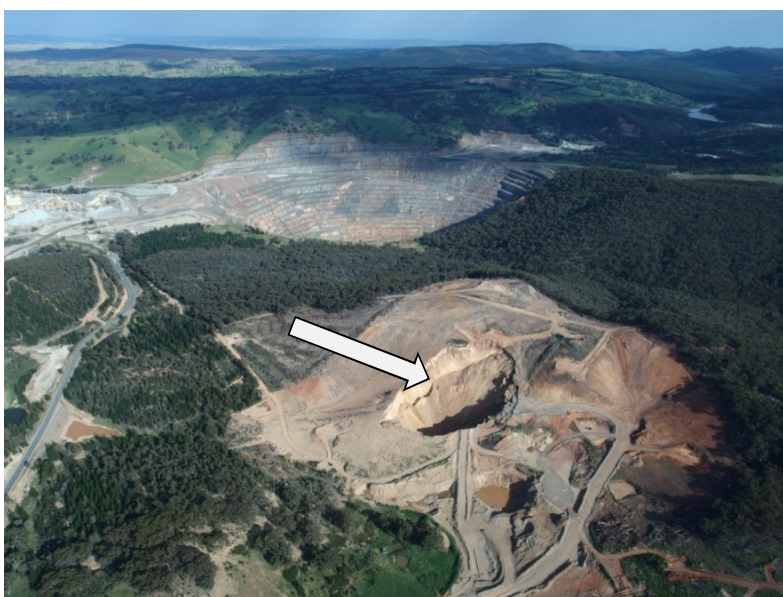
Aerial view of surface breakthrough of Panel Cave 1 at Cadia

Cadia's AUD AISC per ounce increased $57 in the quarter due to the change in feed mix (due to the Cadia East ramp up), commencement of commercial production at Panel Cave 2, declining grades at Ridgeway and increased sustaining capital spend quarter on quarter. Higher sustaining capital was primarily due to the delivery of two loaders for Cadia East. The increase in AUD AISC was partially offset by higher by-product credits.