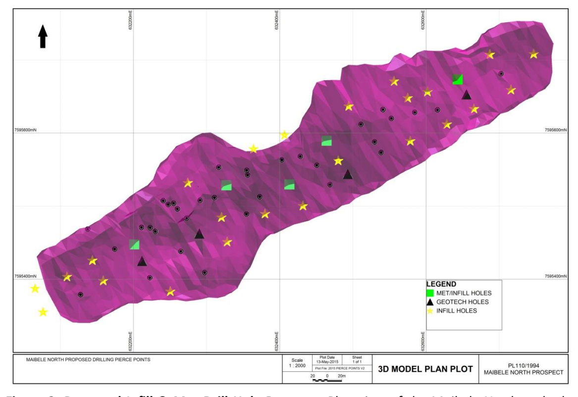
Figure 2: Proposed Infill & Met Drill Hole Program: Plan view of the Maibele North orebody showing the Infill and Met/Geotech pierce points

The ultimate aim of the drilling at Maibele North is to identify a resource sufficient to positively augment BCL's existing nickel processing and smelting activities in nearby Selebi Phikwe. The first step of the process is to delineate a resource of sufficient quality to allow mining feasibility studies to proceed and, if positive outcomes are achieved a submission of a mining licence application.