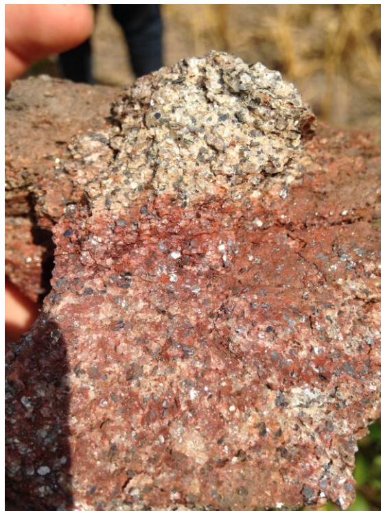
Figure 3 Outcropping Graphite mineralisation Figure 4 Coarse flake graphite mineralisation sample