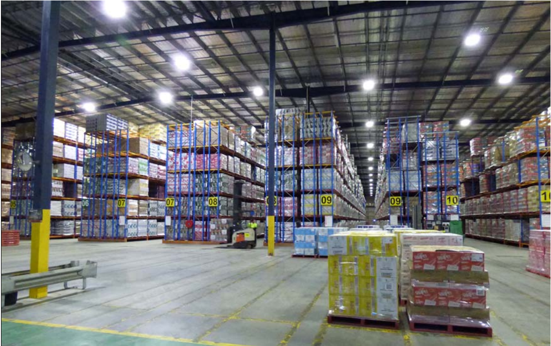
Site after installation of Vivid Industrial's intelligent Matrixx lighting system

The site is a live working facility and the removal and installation of lighting fixtures was accomplished without disruption to operations during a two week period. Feedback from site staff, project managers and independent electrical contractors has been overwhelmingly complimentary. This site was the customer's first full warehouse LED lighting retrofit, in its global portfolio of sites.