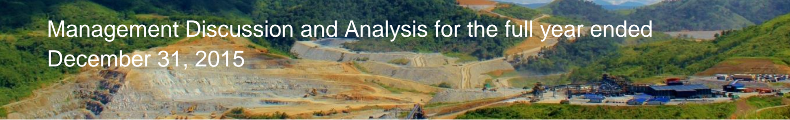
Figure 1 – Haile Water Treatment Plant