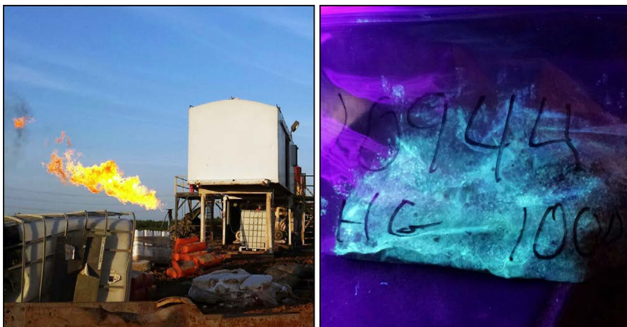
Holcomb 1-H: Hydrocarbon shows from a measured depth of 10,950 feet

The estimated quantities of Prospective Resources that may potentially be recovered by the application of a future development project(s) relate to undiscovered accumulations. These estimates have both an associated risk of discovery and a risk of development. Further exploration appraisal and evaluation is required to determine the existence of a significant quantity of potentially moveable hydrocarbons.