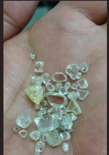
Photograph of diamonds recovered from processing of bulk samples from Newfield Resources Ltd's Allotropes Diamond Project in Sierra Leone.