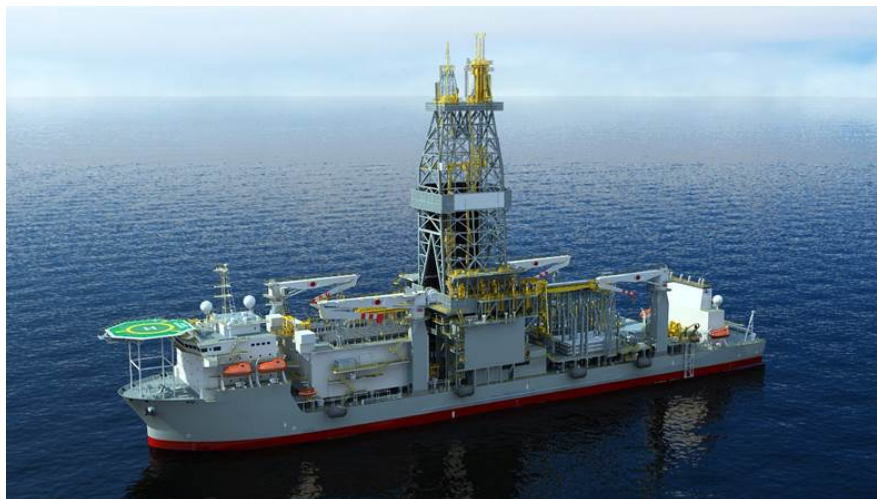
The Atwood Achiever Deepwater Drillship

The Mazagan permit covers an area of 8,717 km 2 and is located off the Atlantic coast of Morocco, in water depths of 1,000-2,500 metres. The Mazagan permit contains significant potential, with four independent plays containing multiple prospects and leads mapped on 2D and 3D seismic data. DeGolyer & MacNaughton has estimated total mean unrisked prospective resources of 7,015 mmbo (net 1,614 mmbo to Pura Vida)* ( reference: ASX announcement 21 September 2012 ).