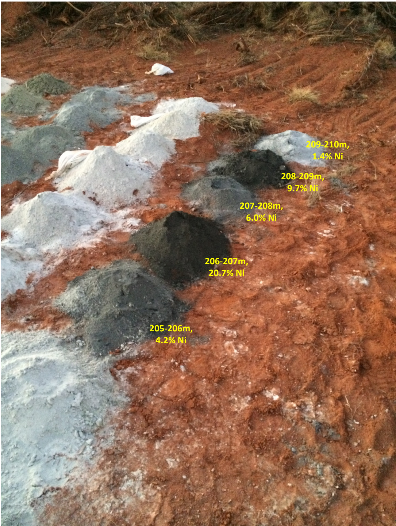
Figure 3: MFEC072 RC Sample Piles