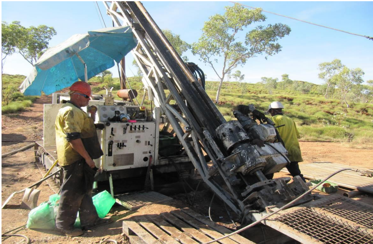
Table 2 Halls creek drilling details