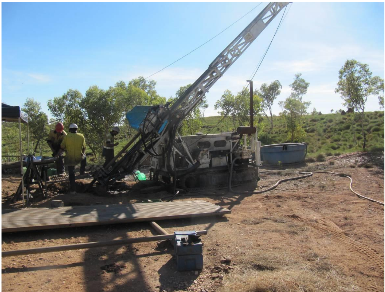
Figure2 Drilling site in Halls Creek project

The core samples have been sent to a laboratory in Perth for analysis.