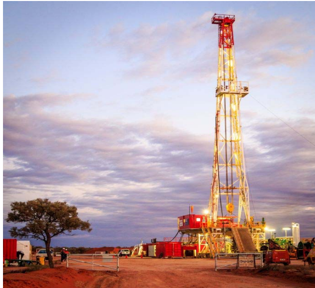
Rig on site at Whiteley-1