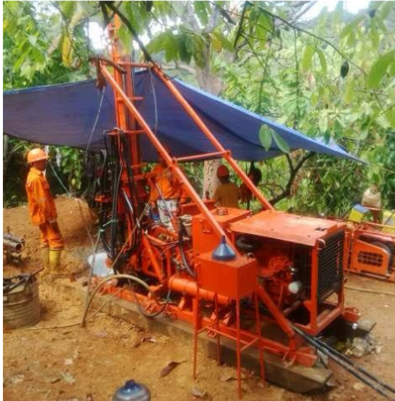
Figure 2: Drill Rig at Tamboli

Upon completion of drilling on the four initial holes, the results will be used to determine a systematic drilling program where the actual number of holes and total meters drilled in the program will depend on the geology intersected in each hole. The on-site geologist will evaluate the data recovered from each hole and will exercise his judgement when collaring subsequent holes in order to optimise the chance for each drill hole to be as effective and as informative as possible.