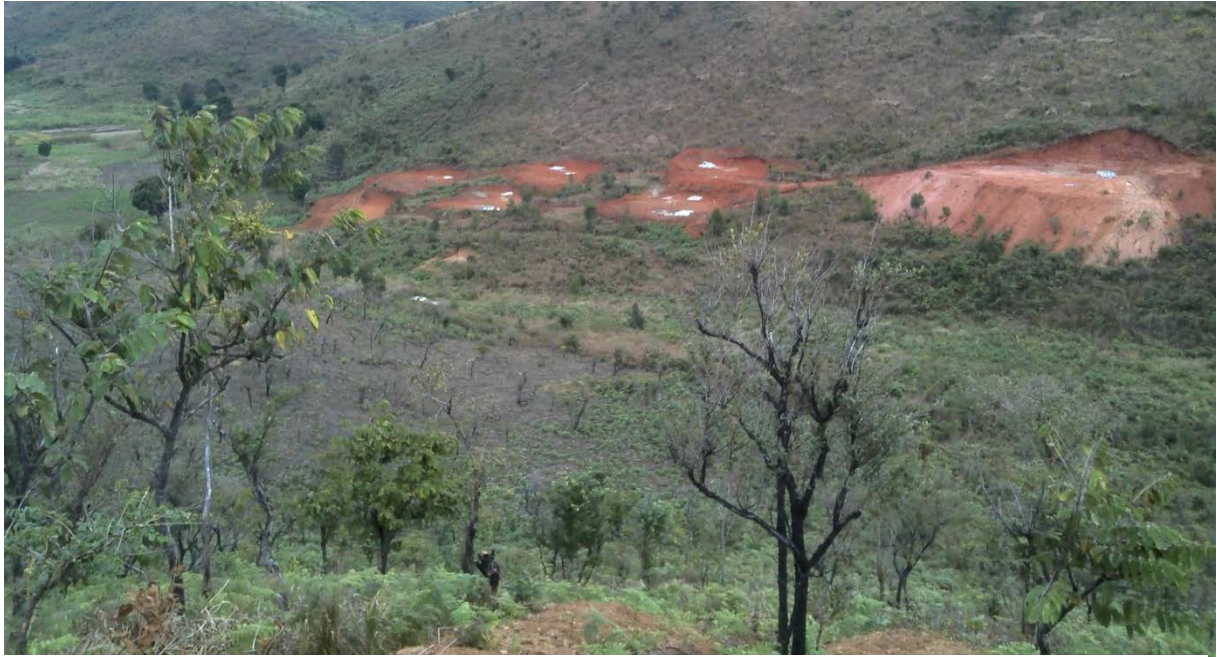
Figure 2. Photo of the recently completed infill drill holes undertaken by Kibaran Resources Ltd located close to the southern boundary of the Mahenge North Project under option to GRK. The photo looks to the southwest and was taken from within GRK's Mahenge North Project license.