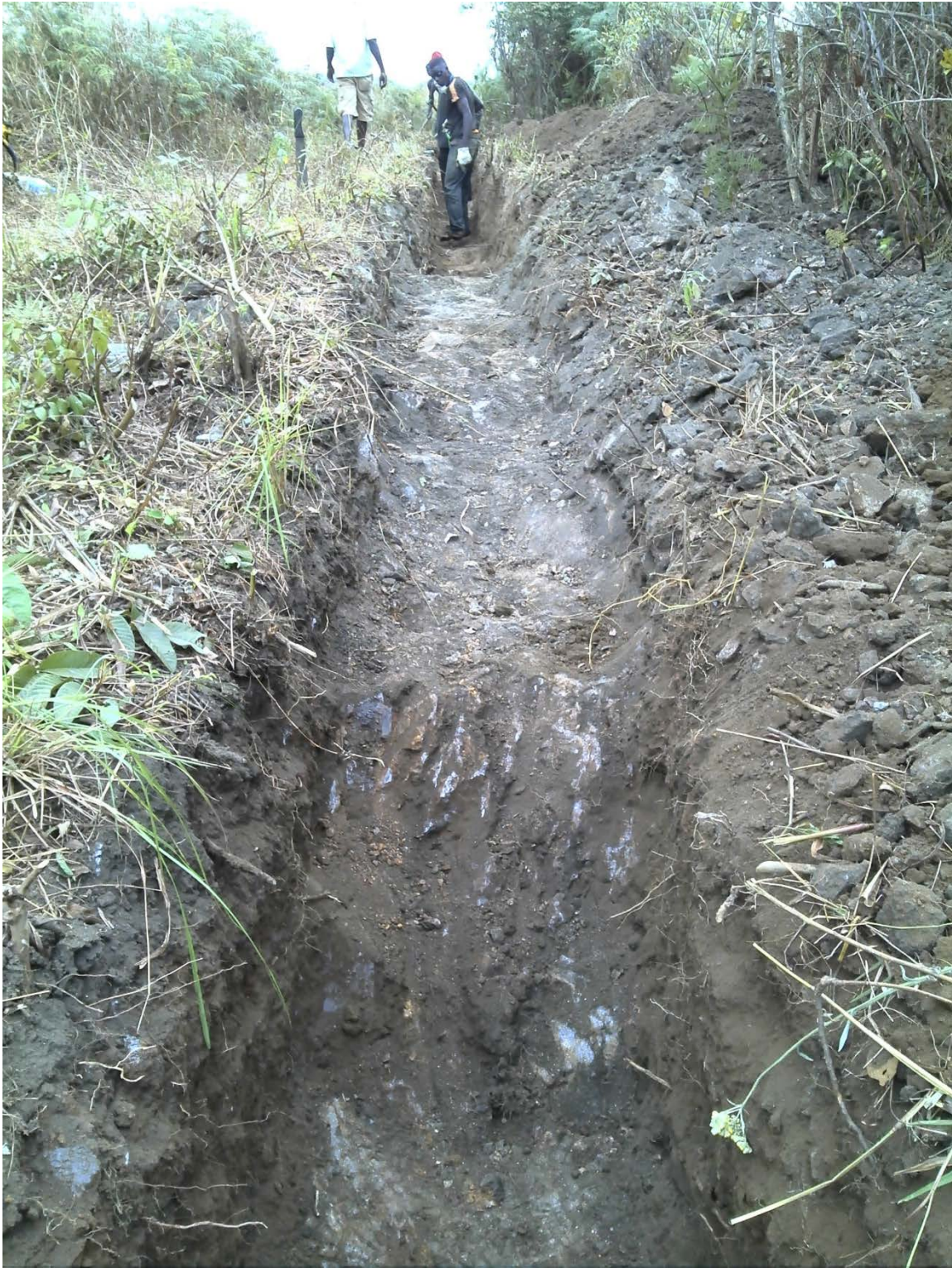
Figure 3. Trenching underway at the Epanko North Graphite Prospect showing good evidence of graphite mineralisation almost at surface