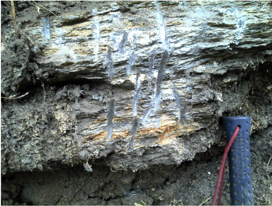
Figure 4. Outcropping graphite mineralisation from Ndololo prospect