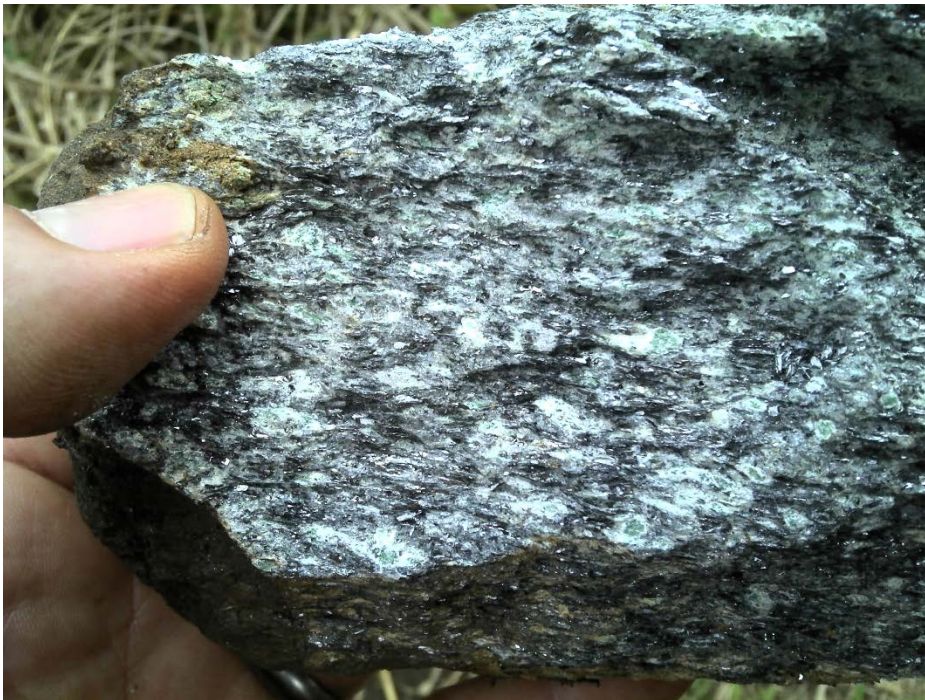
Figure 5. Rock chip sample taken from the Mineralised Strike at the Epanko North Graphite Prospect