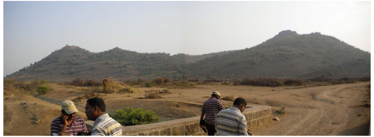
Project Topography at AP14 showing distinctive hillock feature