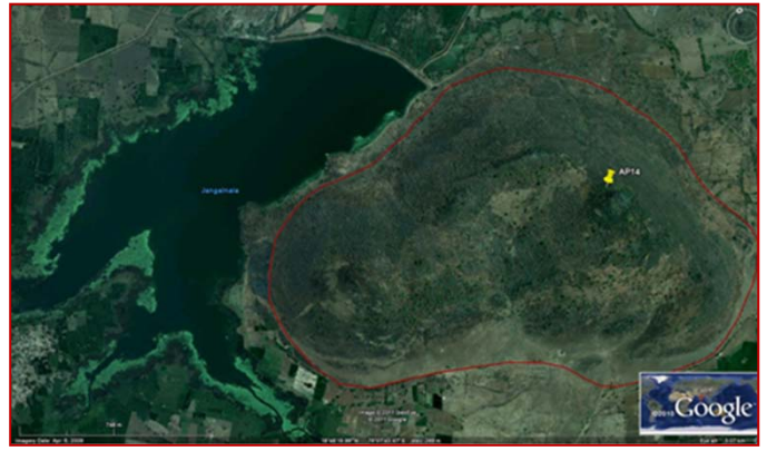
AP14 Location showing nearby water resource