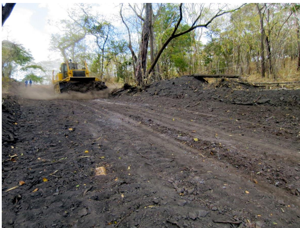
Figure 4. Strong graphite mineralisation present at surface on access tracks at Nicanda Hill prospect

Triton notes the strong presence of continuous graphitic and vanadium mineralisation across the Nicanda Hill and Charmers prospects during the construction of the various access tracks as seen in Figure 4 below.