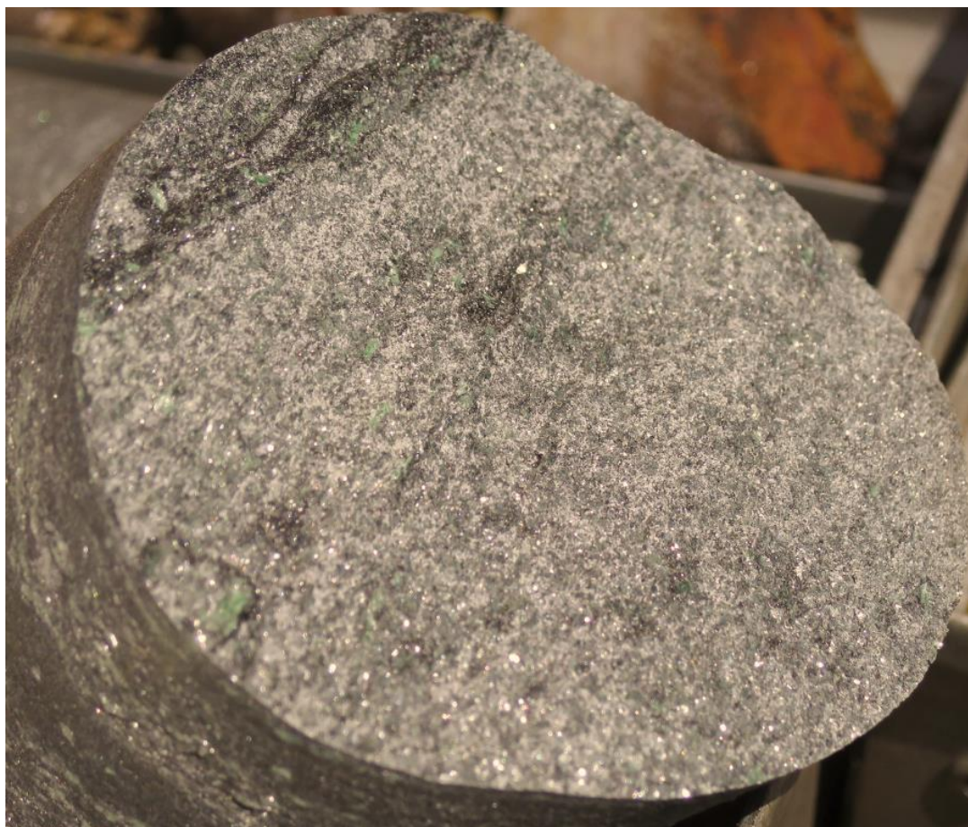
Figure 2. Diamond drill core from Nicanda Hill prospect on License 5966 showing graphite and vanadium mineralisation.

Due to the presence of the strong mineralisation together with the highest VTEM response to in the northern prospects of the mineralisation footprint, Triton has now prioritised the sampling and testing of the drill core obtained from this area (Figure 3).