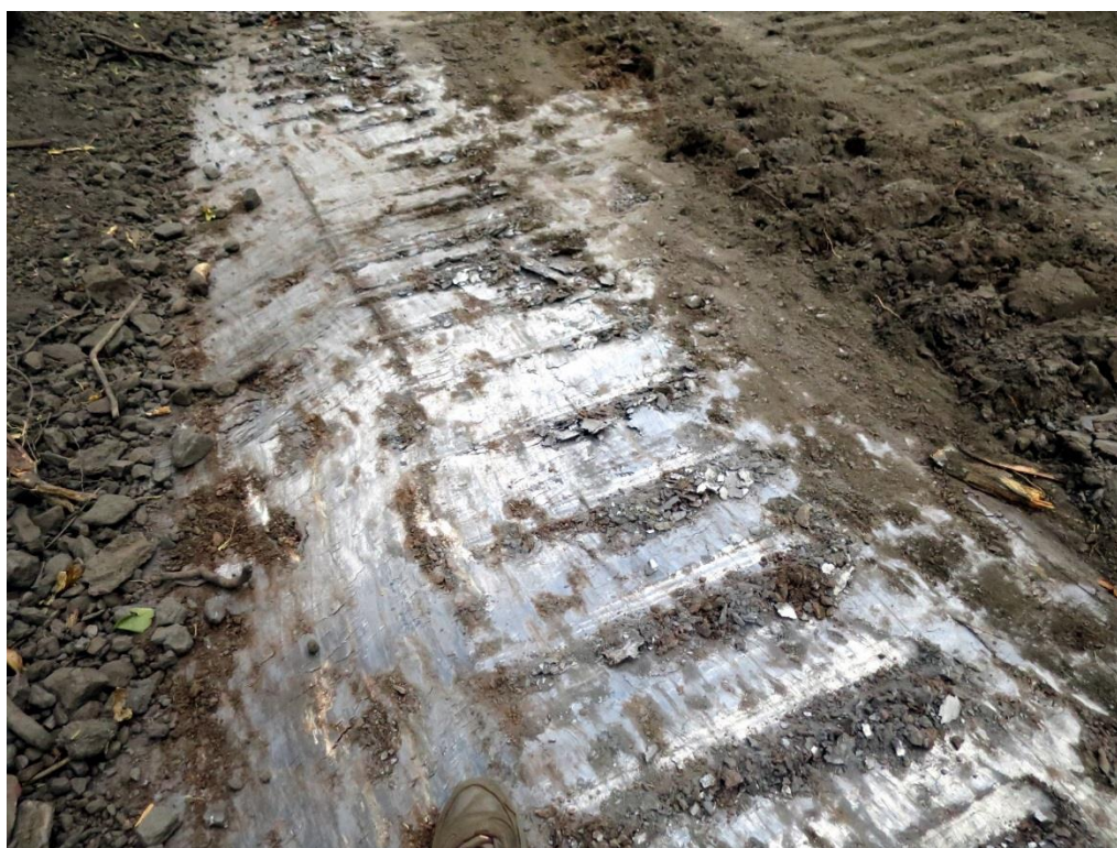
Figure 5. Close up image of high grade graphite mineralisation exposed at surface in HG1 at Nicanda Hill prospect.

The metallurgical test work will then progress to reviewing options for optimisation of graphite flake recovery and the determining the best methods for the delineation of high grade graphitic and vanadium concentrates.