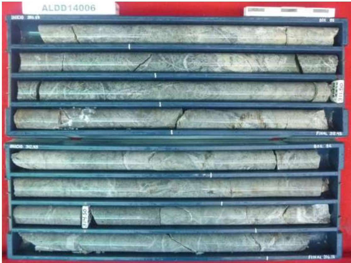
Figure 4 - (drillhole depth 312.45m to 316.1m) Veinlet 2mm to 3mm, quartz, pyrite, chalcopyrite with volcanic tuffs overlying diorite intrusive