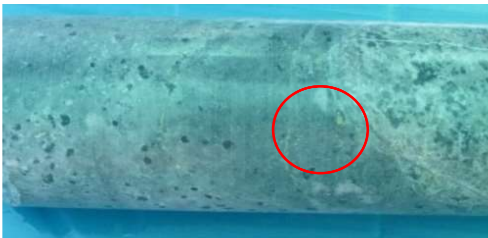
Figure 3 - (drillhole depth 273.65m) Chalcopyrite in epidote-quartz veinlets (0.1cm wide), diorite intrusive, moderate potassic alteration (secondary biotite-orthoclase), moderate silicification.