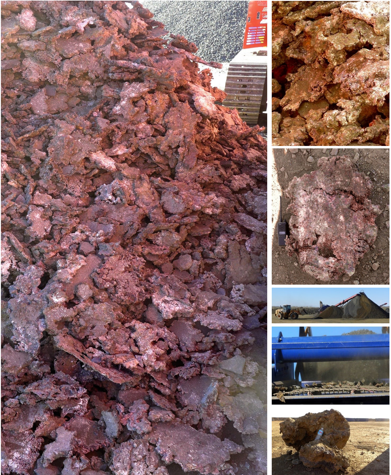
Figure 6: Left; high-grade DSO (+40mm) visually estimated at 90% Cu in this batch, scalped off the crusher screens - predominately native copper (99.65% Cu). Right (top to bottom); close-up of +40mm scalped product; large 60kg copper nugget; -40mm crushed product; containers of +40mm scalped product; up-close detailed image of operating +40mm screens showing flattened native copper being removed; and large native copper nuggets of predominately native copper on the ROM with DSO containers in the background.