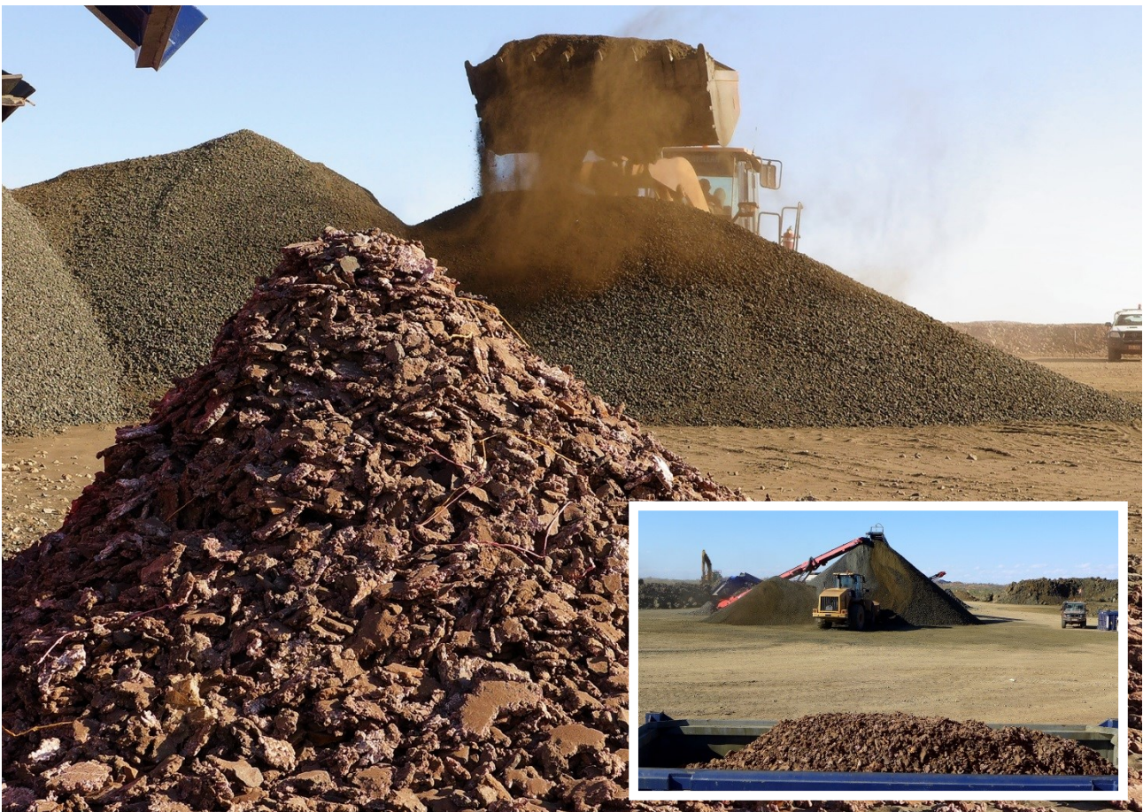
Figure 3: High-grade DSO (+40mm) scalped off the crusher screens. Predominately native copper (99.65% Cu), with minor cuprite (88.8% Cu) and chalcocite (79.9% Cu) and various supergene copper species. Inset; crushed product under the -40mm conveyors and +40mm scalped native copper DSO product in containers in foreground.