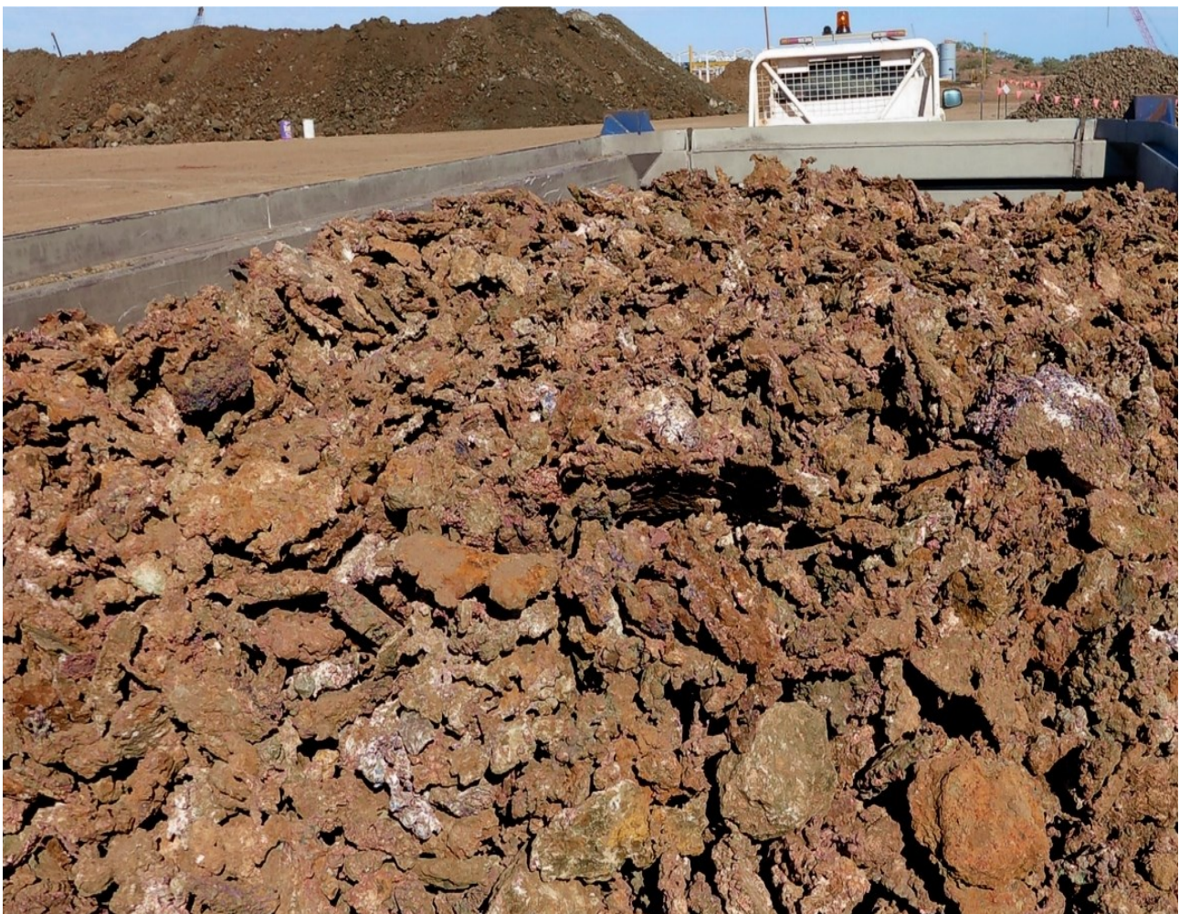
Figure 1: Container full of DSO straight from the crusher screens estimated 85-95% Cu, (+40mm—110mm)

After significant effort including numerous trials, exhaustive due diligence and discussions with several third parties, and with sufficient quantities of high-grade and DSO ore on the ROM stockpiles and bulk-tonnage crushing of various DSO products recently completed, 5 different Copper ore types, grades and compositions are being shipped for smelter testing.