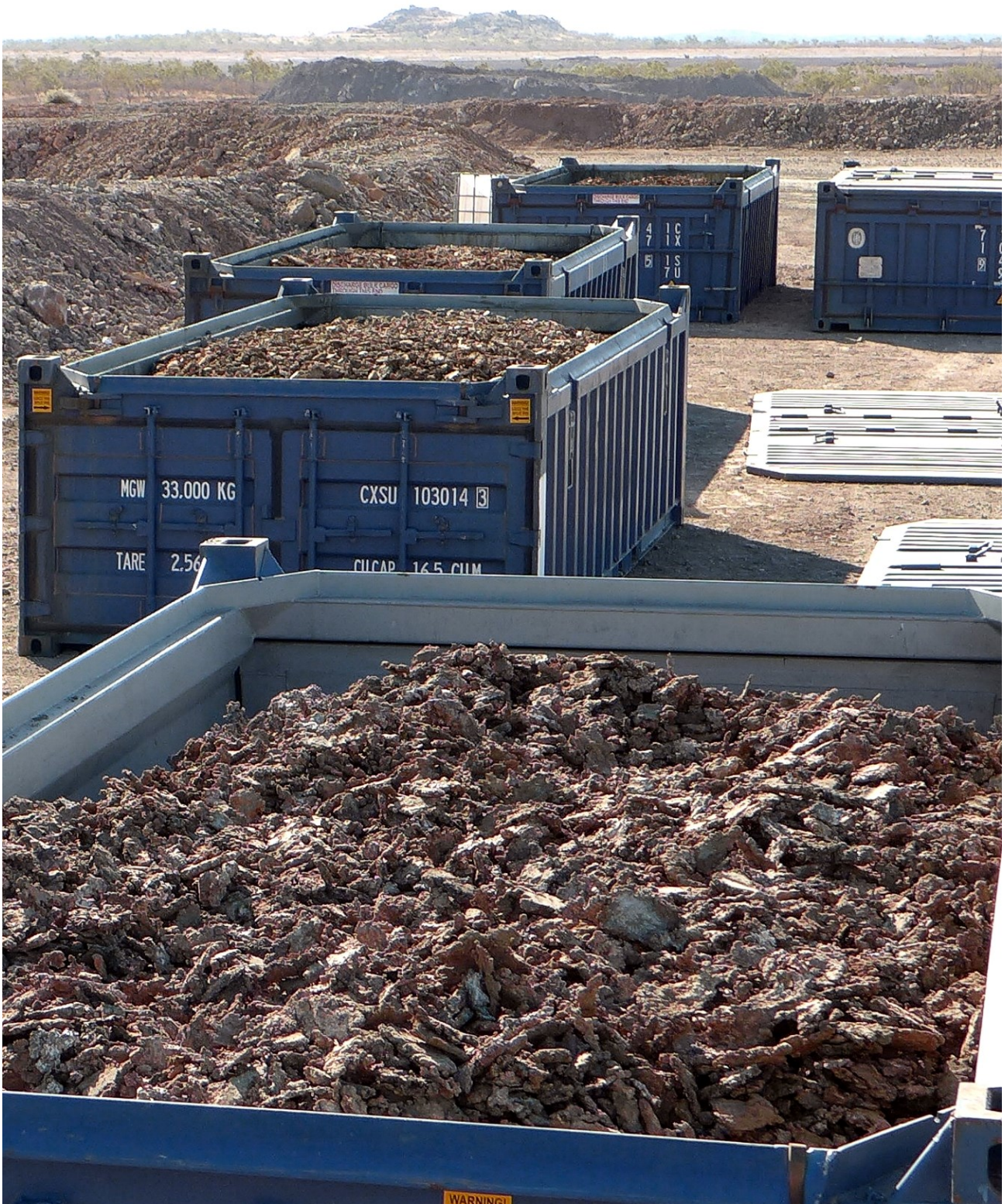
Figure 2: High-grade DSO (+40mm) visually estimated at 80-90% Cu, scalped off the crusher screens and loaded into containers ready for shipment. Each container holds between 22-25 tonnes of predominately native copper (99.65% Cu), with cuprite (88.8% Cu), chalcocite (79.9% Cu) and various supergene copper species.