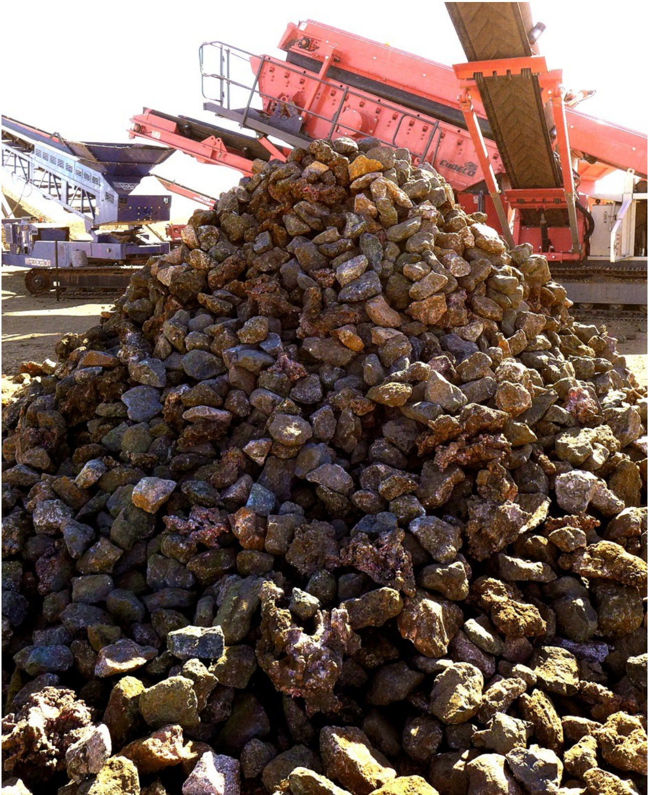
Figure 5: Scalped coarse DSO (+110mm) product includes coarse native copper nuggets, coarse and fine native copper in rock matrix (native copper contains 99.65% Cu), chalcocite masses, blebs and infill (79.9% Cu), cuprite (88.8% Cu) and various secondary copper species, visually estimated at ~30% Cu in this batch.