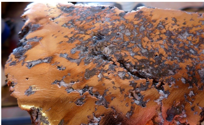
Figure 8 (above); large predominately native copper mass weighing ~130kg, with marks from the mobile jaw crusher imprinted onto its surface. This sample did not appear particularly solid at first glance (see Figure 7 previous page), but once a thin layer of surface rock was removed with a hammer, near solid copper metal was revealed.