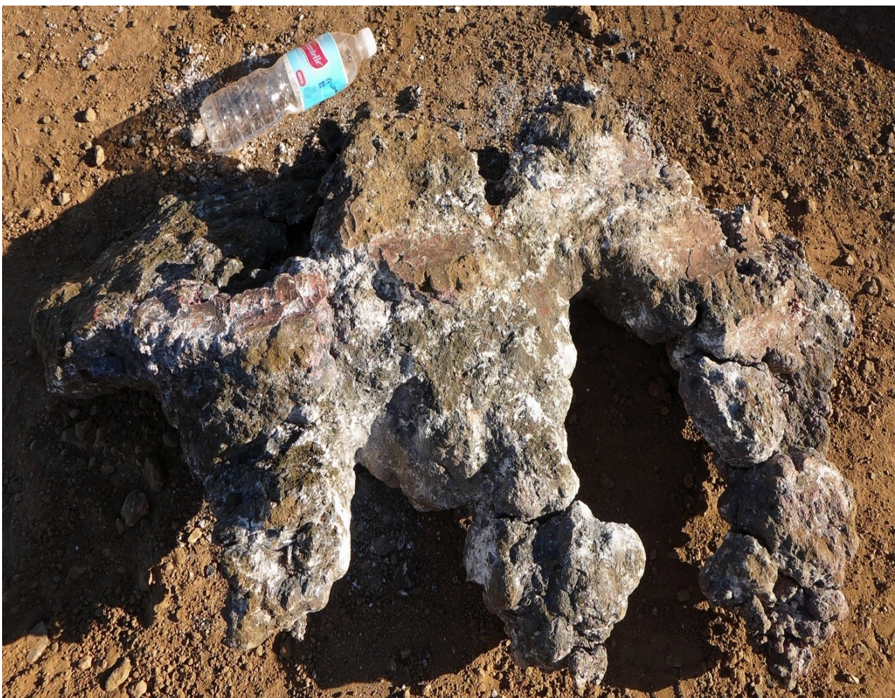
Figure 7: Large 130kg predominately native copper mass, with marks from the jaw crusher imprinted onto its surface. See following page for further details.

Delivery of refined copper product within mainland China is currently fetching significant premium to LME pricing for spot copper, recently quoted to the Company at US$8,400 per tonne, so remains a significantly