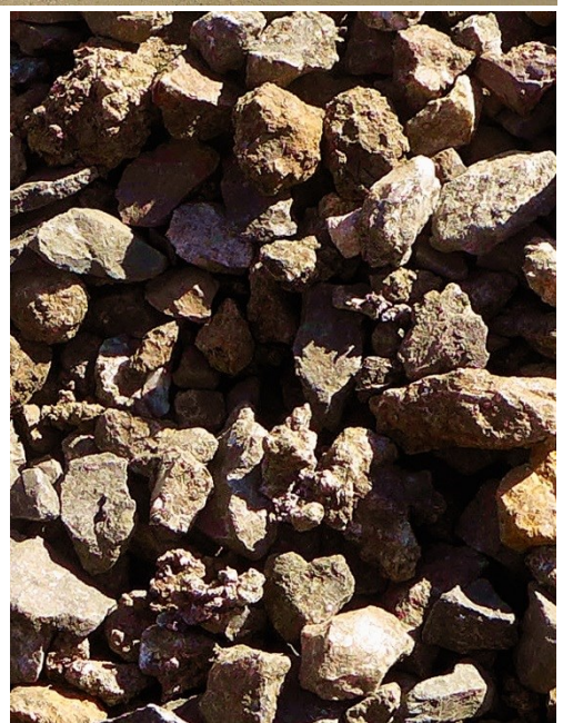
Figure 4: High-grade crushed ore (after removal of +40mm NCu) estimated (10-15% Cu - see detail above and right), stockpiled for processing through the Company's ore-sorter, loaded into containers for shipping. The crushed ore consists of native copper (99.65% Cu), with cuprite (88.8% Cu), chalcocite (79.9% Cu) and various supergene copper species.