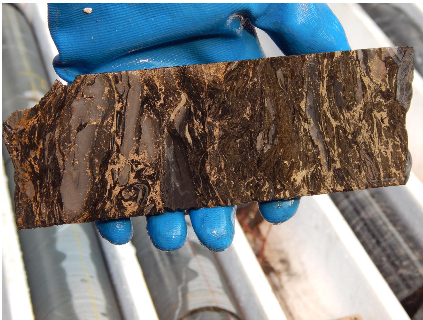
Figure 1: A section (515.6 to 516.8 metres) of the four-metre wide sulphide zone intersected by drill hole SMDD002 at the Simmons prospect. This drill hole was designed to test the source of the bedrock conductor identified beneath a historic nickel-in-soil anomaly. Further information on this hole will be provided once the Company receives the final assay results and down hole electromagnetic survey data.

Whilst the Company's initial drilling program did intersect multiple sulphide zones at Simmons, neither drill hole adequately explains the strong nickel and copper soil anomalies previously reported over the prospect area 1 .