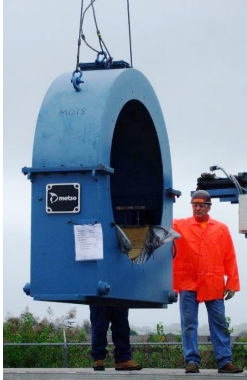
MILL TRUNION COVER