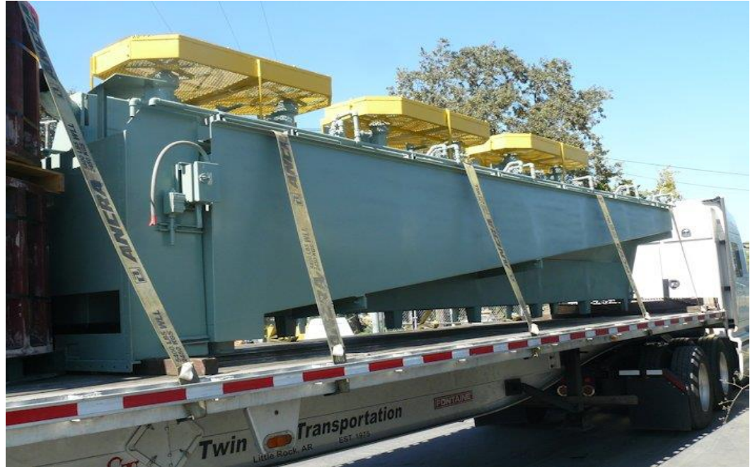
PART OF THE DENVER 21's – CLEANER CIRCUIT CELLS

The flotation plant has been design for inclusion of a regrind ball mill to facilitate upgrading of the final concentrate. It is not yet confirmed if this regrinding stage is essential. Flotation circuit design will comfortably accommodate ores with copper grades up to 10% Copper.