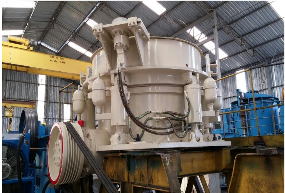
AVANCO'S SECONDARY CONE CRUSHER

The crushing equipment is being manufactured in Belo Horizonte Brazil and is expected to be available as early as mid November.