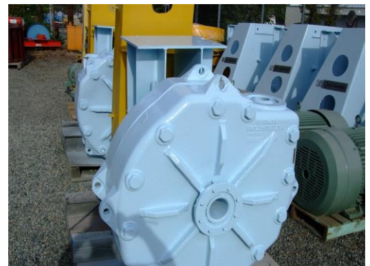
MILLING CIRCUIT SUPPLY COMPLETE WITH PUMPS