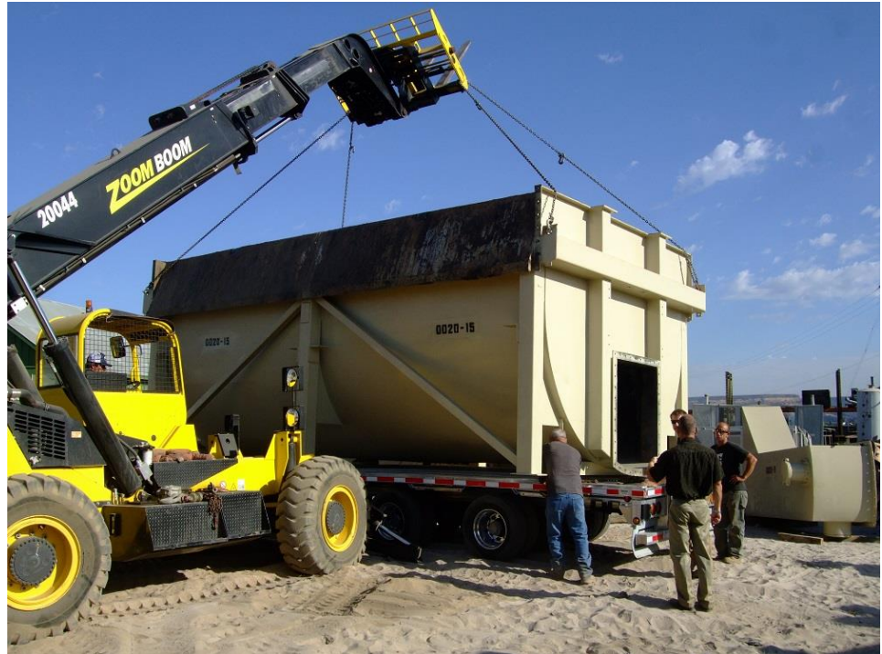
OK 38 TROUGH TYPE FLOTATION CELLS FOR ROUGHER-SCAVENGER DUTY