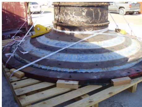
MILL HEAD END