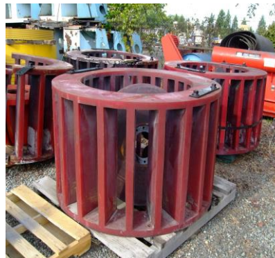
OK 38 FLOAT CELL STATOR

The float circuit has been very generously sized, and configured to replicate the neighbouring and very successful Sossego Copper plant design. Between the conservative sizing, high-grade ore and simple metallurgy, management anticipate that high copper recoveries will be achieved.