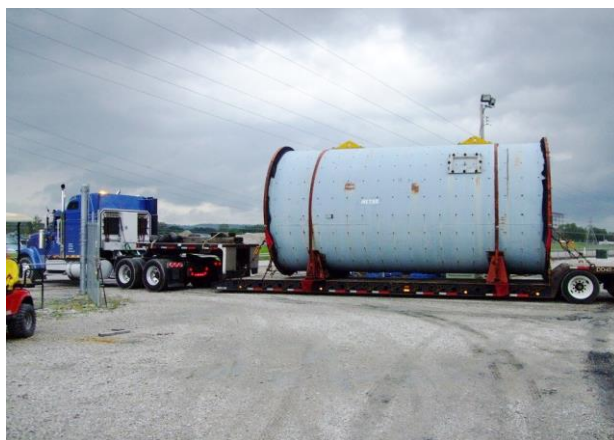
BALL MILL ON ROUTE TO CARAJAS

The 19mm crushed ore will be fed into the ball mill and ground with water to produce a slurry with 80% of the particles ground to a size smaller than 150µm. The mill discharge will be pumped to the flotation process using slurry pumps.