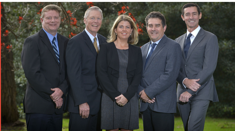
Board and Management (left to right)