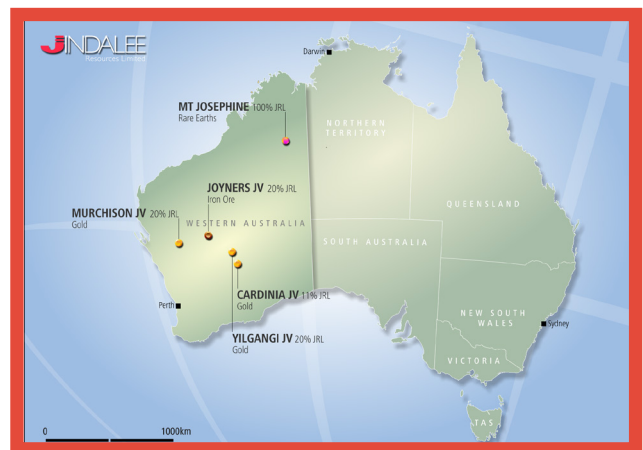
Jindalee Lead Projects

Over the previous 12 months, Jindalee's management team has continued to actively assess a large number of potential project opportunities, both within Australia and overseas. Although to date these opportunities failed to meet our expectations, we remain confident that a substantive new project will soon be added to our portfolio. Our relatively tight capital structure (only 34.8 million shares on issue) provides shareholders with great leverage should the Company's initiatives prove successful.