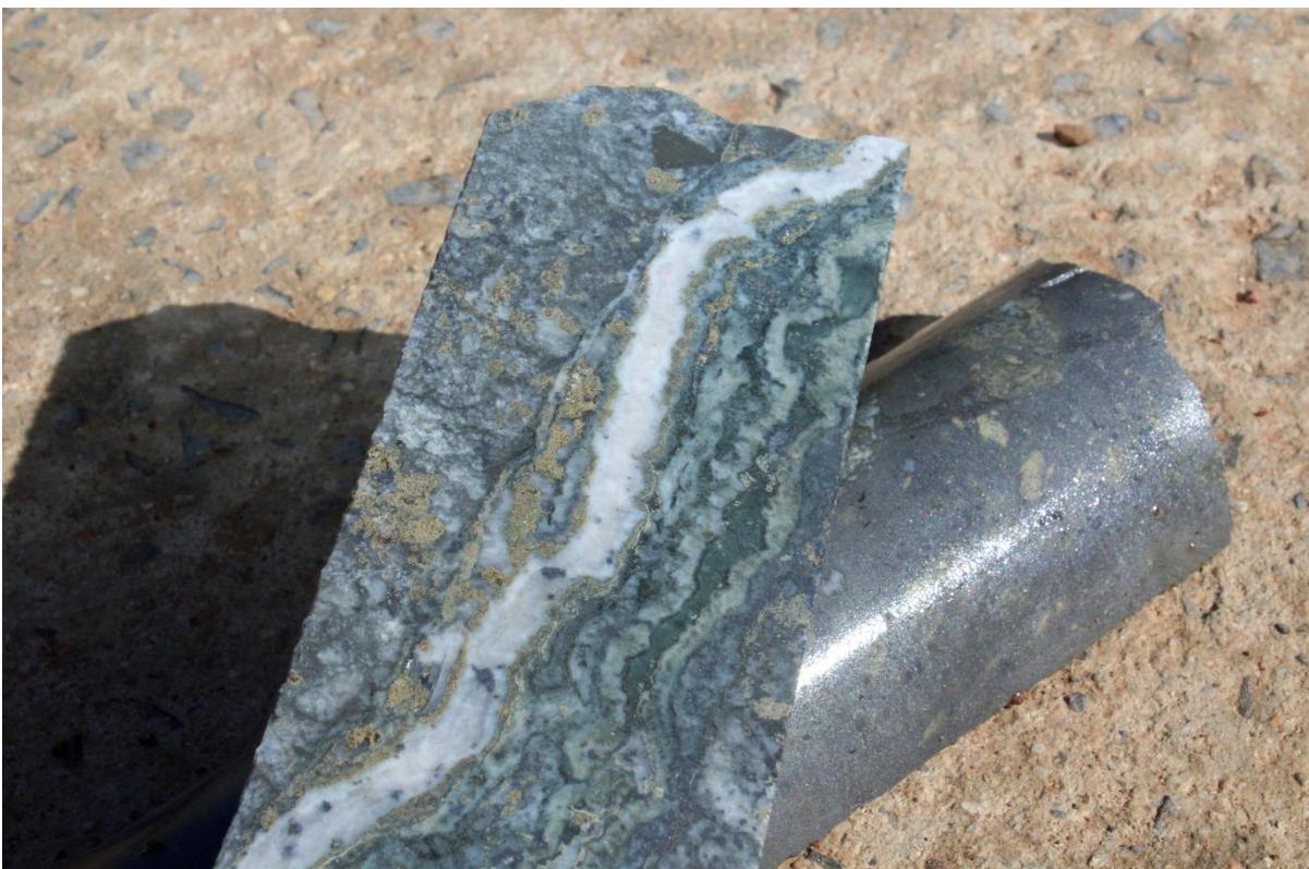
Figure 1. High grade polymetallic mineralisation intersected by surface drill hole KMHDD023, including massive galena (lead).

KBL Mining Limited (ASX: “KBL” or “the Company”) is pleased to announce that results from recent drilling continue to highlight opportunity for the A Lode to underpin long term polymetallic production from the Southern Ore Zone at Mineral Hill.