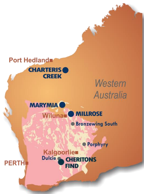
Figure 1: Marymia and Western Australia Project Locations

The Marymia Project is located approximately 30 kilometres east of the 4.7M oz Plutonic gold mine, 55 kilometres north-east of Sandfire Resources NL's DeGrussa copper-gold mine (550,000 tonnes contained copper metal), and 12 kilometres east-north-east of Ventnor Resources Limited's Green Dragon and Thaduna copper deposits (100,000 tonnes contained copper metal) in Western Australia's Mid-West region ( see Figures 1 and 2 ).