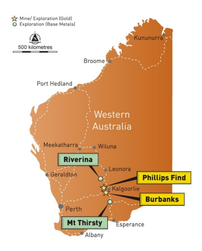
Project Location Map

Abbreviations: AC=Aircore, Au=gold, Co=cobalt, DEC=Department of Environment and Conservation, DD=Diamond, DMP=Department of Mines and Petroleum, g=grams, g/t=grams per tonne, kg=kilograms, km=kilometres, lb/s=pound/s, LME=London Metal Exchange, It=litre, m=metres, min=minutes, ml=millilitre, mm=millimetre, Mn=manganese, Mt=million tonnes, Ni=nickel, oz/s=ounce/s, pH=measure (1-10) of acidity (1 acid, 7 neutral, 10 basic), ppb=parts per billion, ppm=parts per million, RAB=Rotary Air Blast, RC=Reverse Circulation, RL=Reduced Level, t=tonnes, tpa=tonnes per annum µm=micro metres, @= grading, %=percent, °C=degrees celsius.