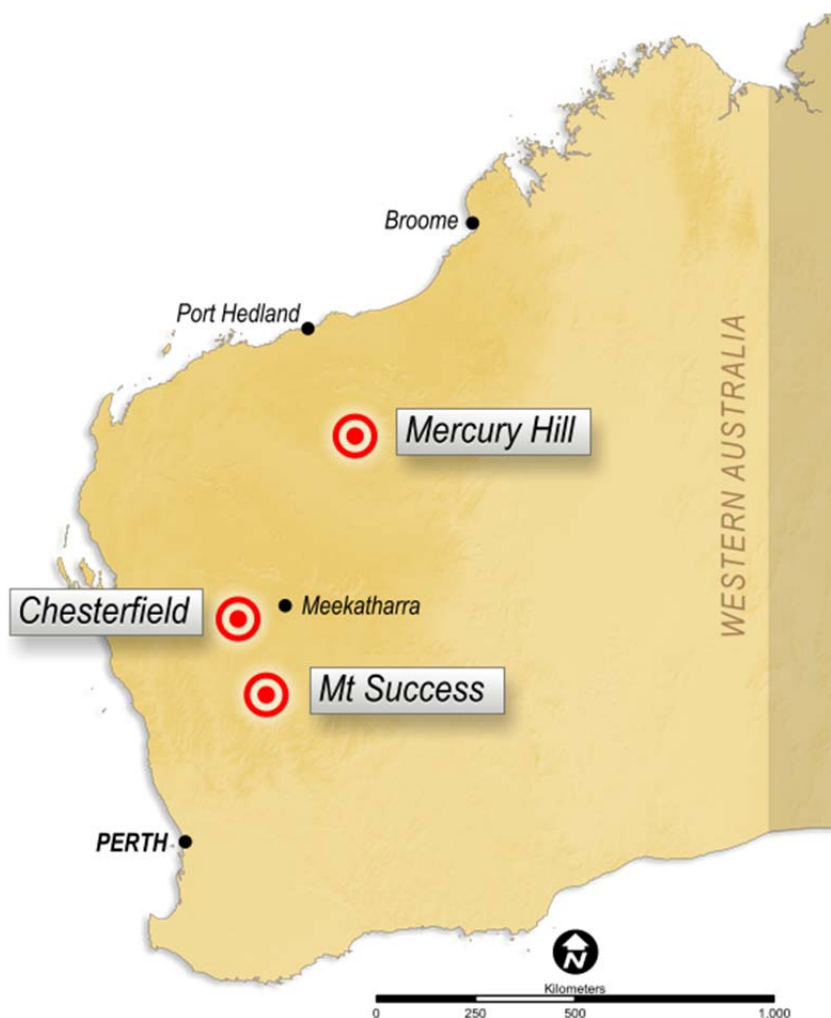
WESTERN AUSTRALIA GOLD PROJECT LOCATIONS