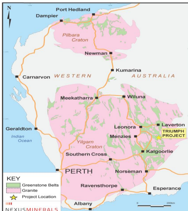
Figure 1. Triumph Project location, Western Australia.

The Triumph Project is located in the Eastern Goldfields of Western Australia, some 145km northeast of Kalgoorlie (figures 1 and 2).