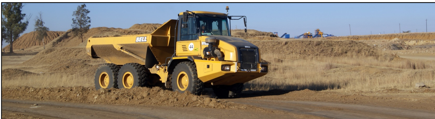
Construction of main haul road to siding at Ntendeka Colliery