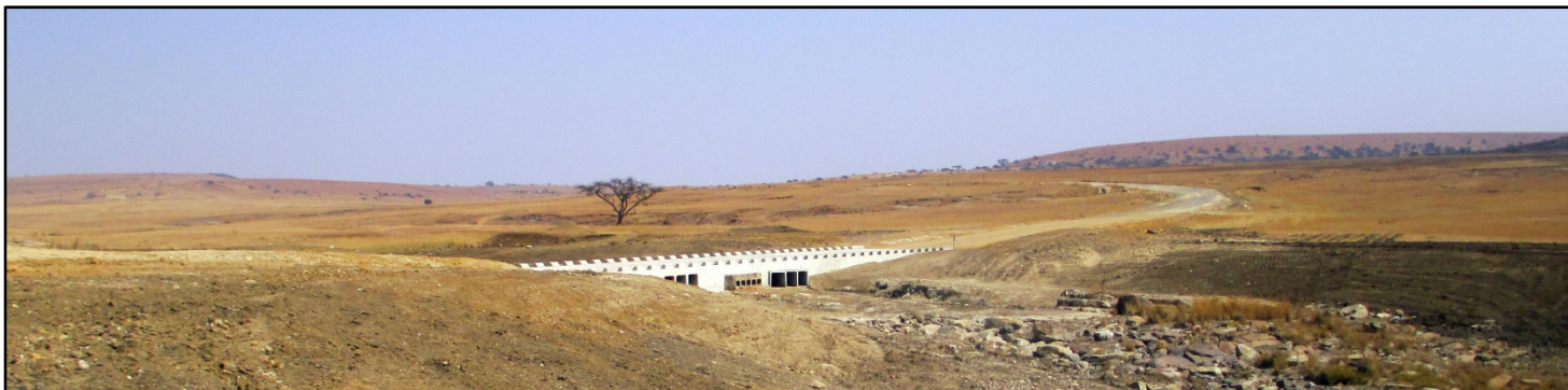
One of the bridges constructed by Ikwezi on the main haul road from the Ntendeka Colliery wash plant to the Ngagane siding