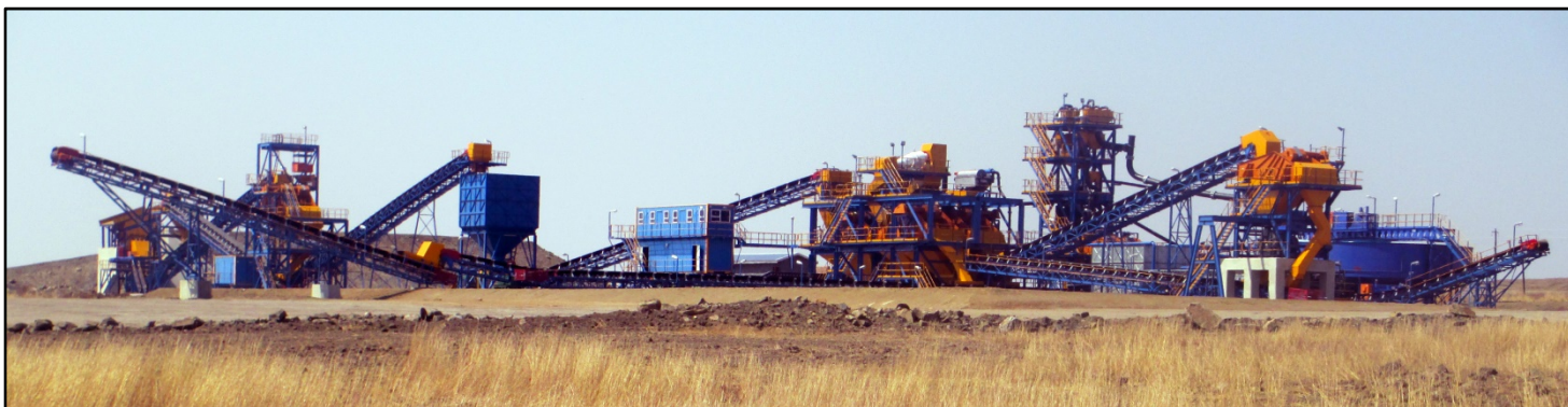
Ntendeka Colliery – coal wash plant

Over the longer term, we propose to realise the full potential of all of the projects to provide us with the foundation from which we can seek to expand production and create further shareholder value through the acquisition, exploration and development of coal projects in South Africa.