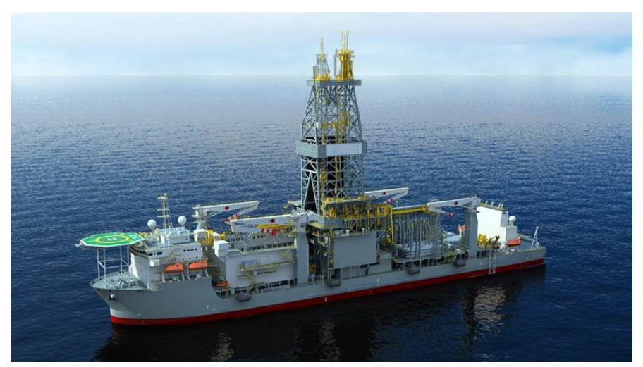
The Atwood Achiever Deepwater Drillship

The Mazagan permit covers an area of 8,717 km<sup>2</sup> and is located off the Atlantic coast of Morocco, in water depths of 1,370-3,000 metres. The Mazagan permit contains significant potential, including Miocene, Cretaceous and Jurassic targets. DeGolyer & MacNaughton has estimated total mean unrisked prospective resources of 7,017 mmbo (net 1,614 mmbo to Pura Vida)* (reference: ASX announcement 21 September 2012).