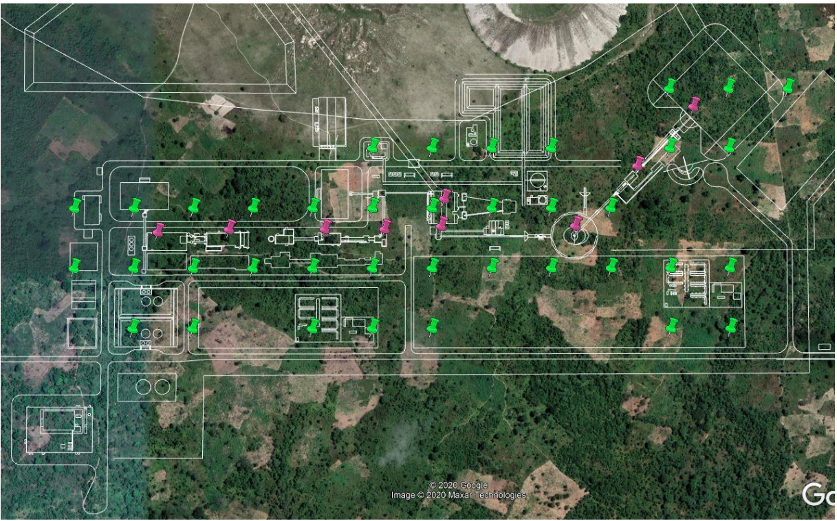
Figure 2. Test pits (green) and drill holes (pink) superimposed on the plant design