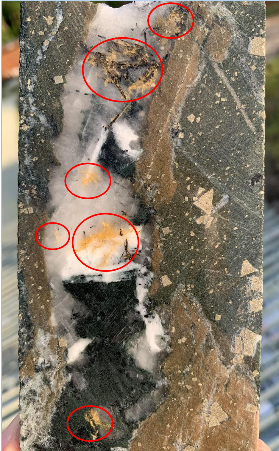
Figure 2 – Photograph of SDD189 from 225.2 to 225.3 which assayed at 1,176.99 g/t Au. The occurrence of visible gold is red-highlighted.

Figure 2 highlights the abundant visible gold in SDD189. The gold is associated with tourmaline needles within quartz veining. Brown albite alteration and coarse euhedral pyrite crystals are also typical of these very high-grade gold drill intersections. This section of core is part of the one meter section from 225 m that assayed 1,176.99 g/t Au.