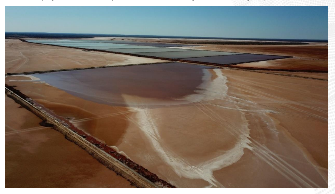
Figure 3: Commissioning of fourth pond train underway

Construction progressed on the fourth pond train and commissioning commenced during the quarter.