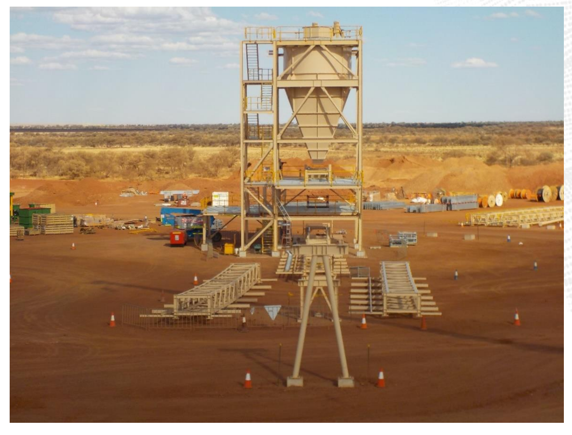
Figure 8: In Feed Transfer Crushing Station