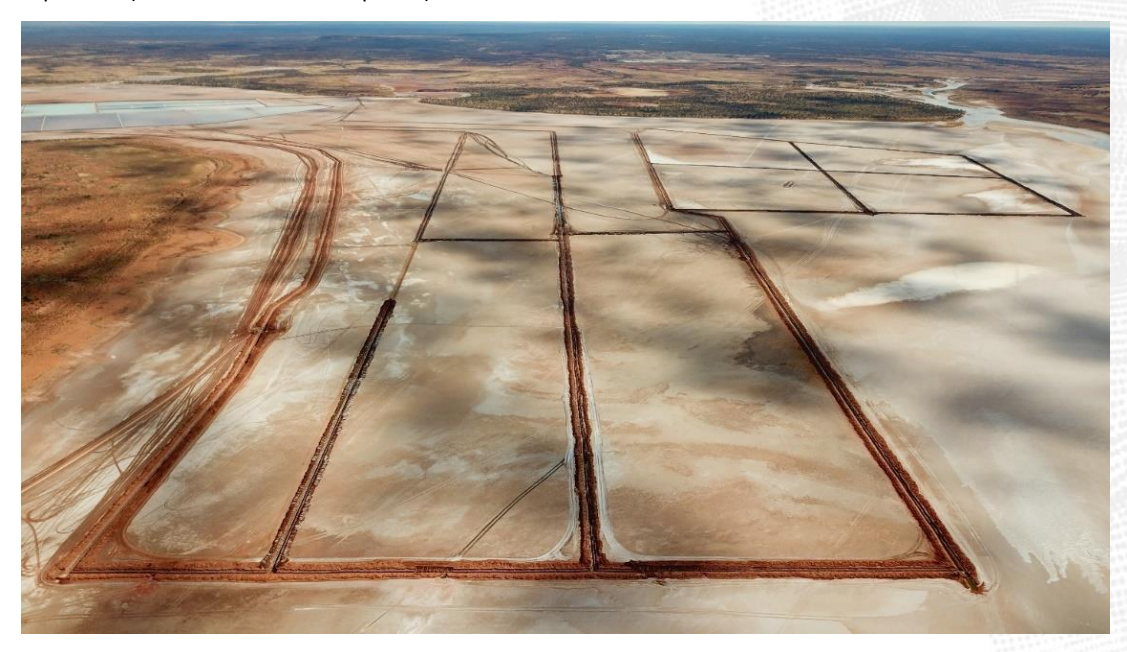
Figure 1: Northern Trench Network

Trench development continued during the quarter with total trench length extended to 62km by the end of September (from 48km at end June quarter).