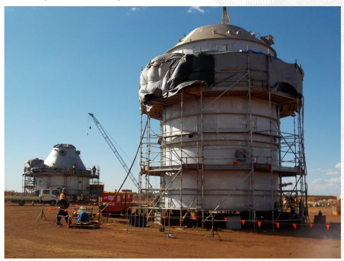
Figure 9: Tank fabrication

In parallel, assembly and welding of the stainless steel Crystallisers and Leach tank continued, with the Leach tank well advanced in its final position. The assembly and welding of the Carbon steel tanks commenced during the period with 22% completion at the end of the quarter.