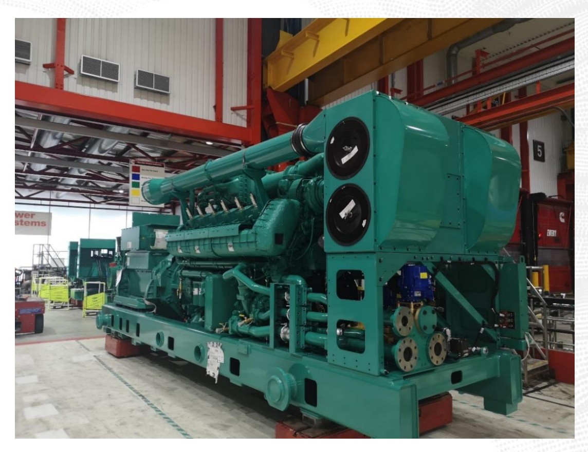
Figure 11: A Cummins HSK78 gas generating set destined for Lake Way

Construction of the warehouse and workshop facility continued during the quarter, with minor service works still to be installed. The Administration complex, onsite laboratories, crib room, and ablutions were all installed during the quarter.