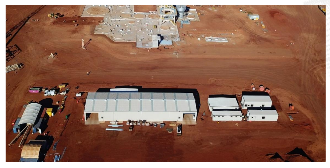
Figure 12: Lake Way warehouse, workshop, laboratory and ablutions

Construction of the warehouse and workshop facility continued during the quarter, with minor service works still to be installed. The Administration complex, onsite laboratories, crib room, and ablutions were all installed during the quarter.