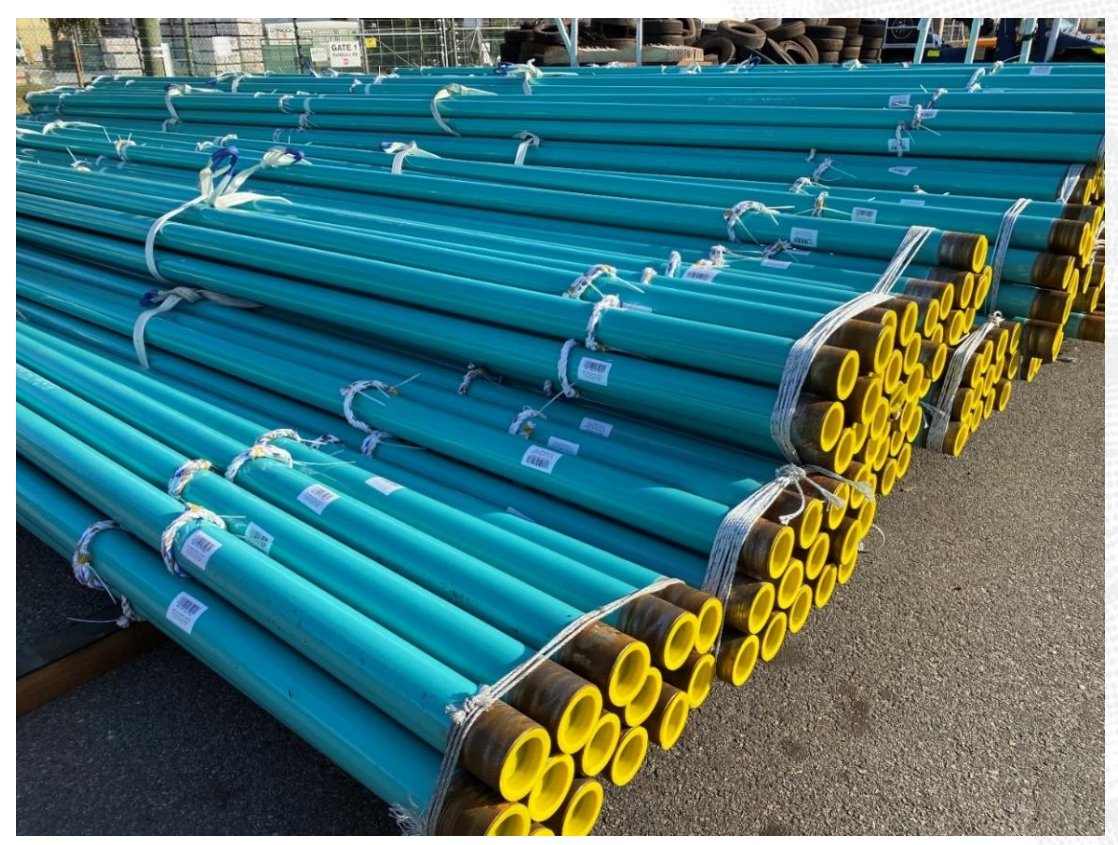
Figure 10: Line pipe for gas supply pipeline

During the quarter, a Gas Transport Agreement, Development Agreement, and Licence Agreement was executed with APA. Design and approvals for the gas lead-in between the Goldfields Gas Pipeline and the Lake Way site progressed, and procurement of the line pipe and other long-lead items also commenced during the quarter.